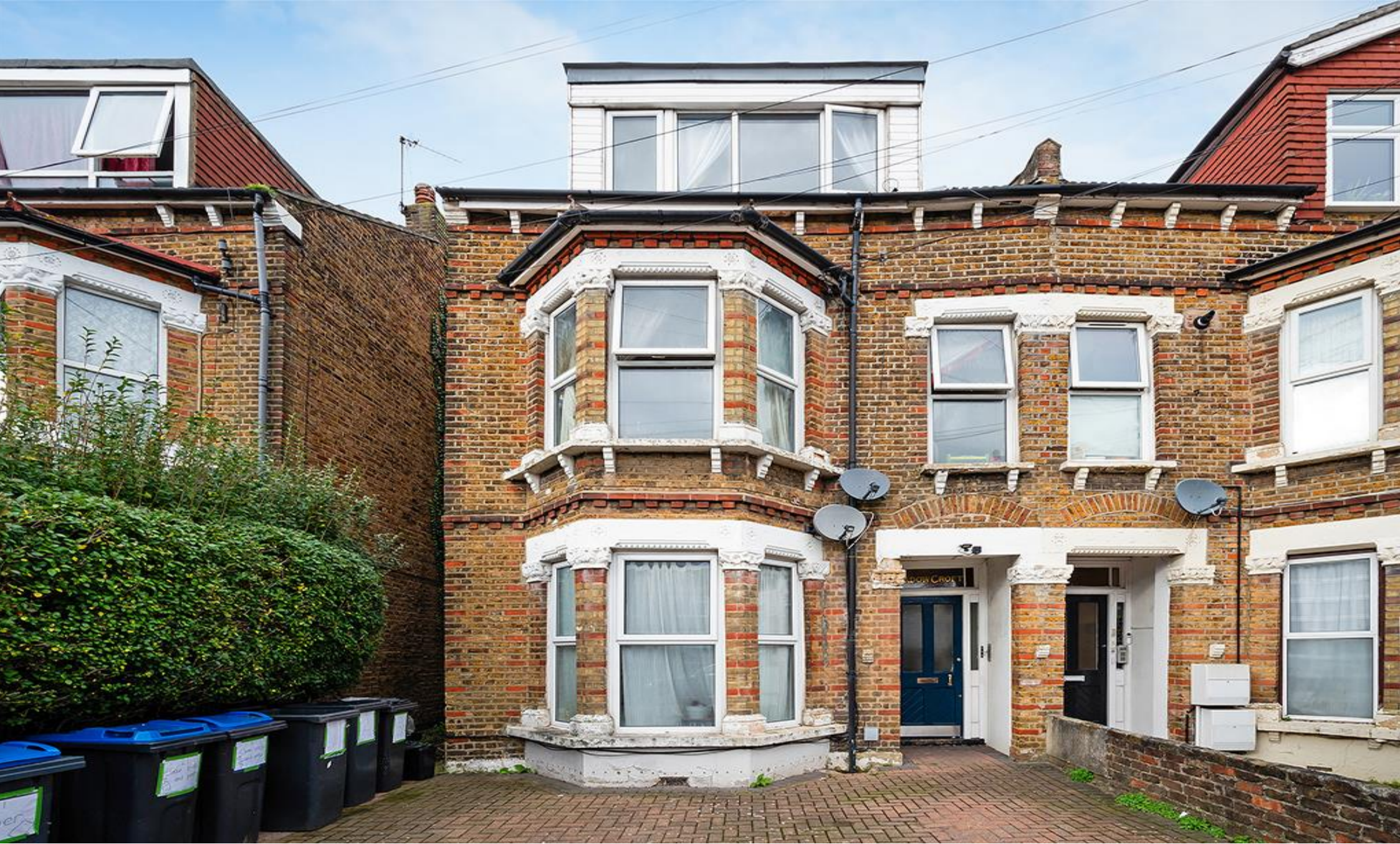
Cameron Road, Croydon CR0 2SR