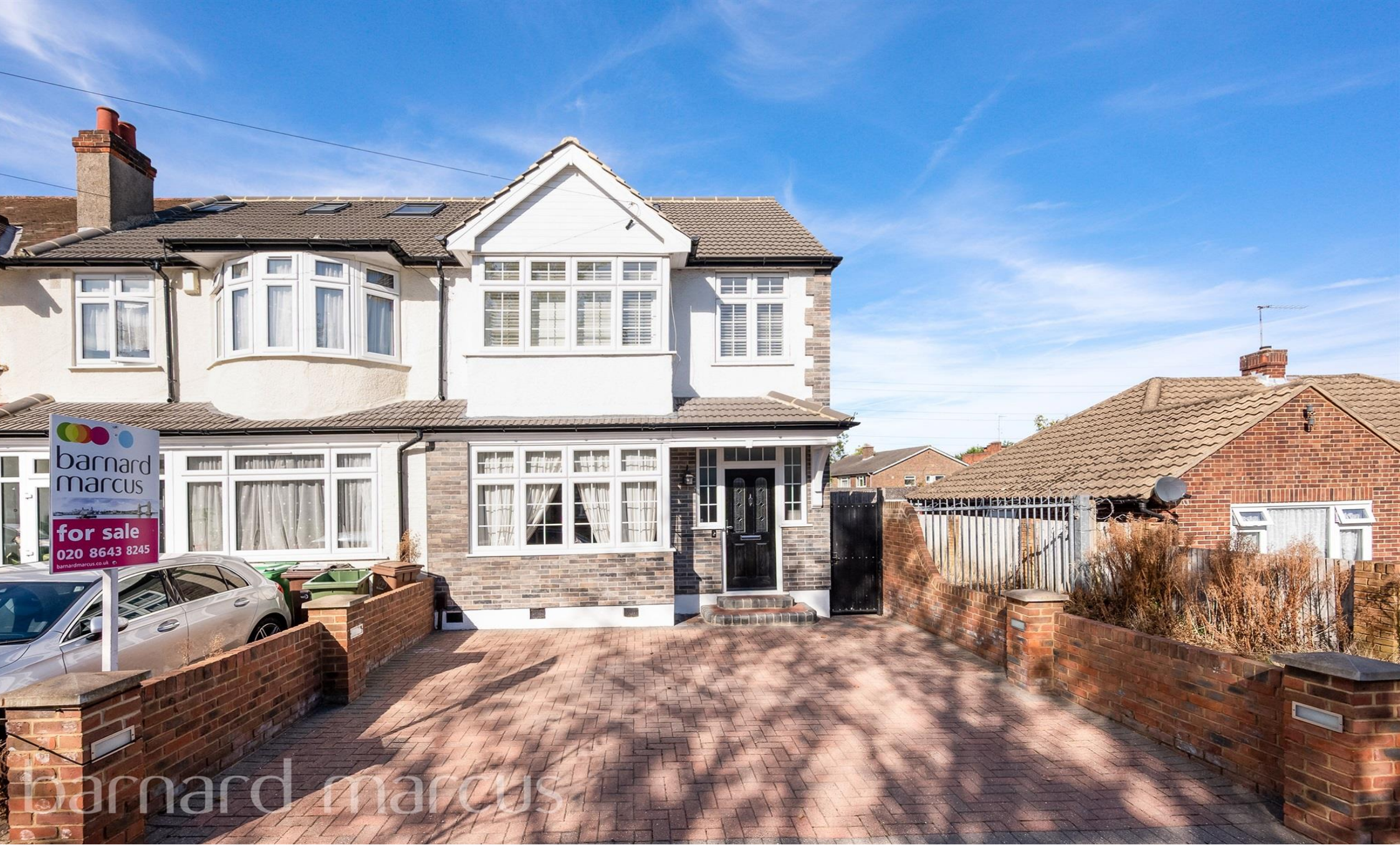
Fairlands Avenue, Sutton SM1 3JE