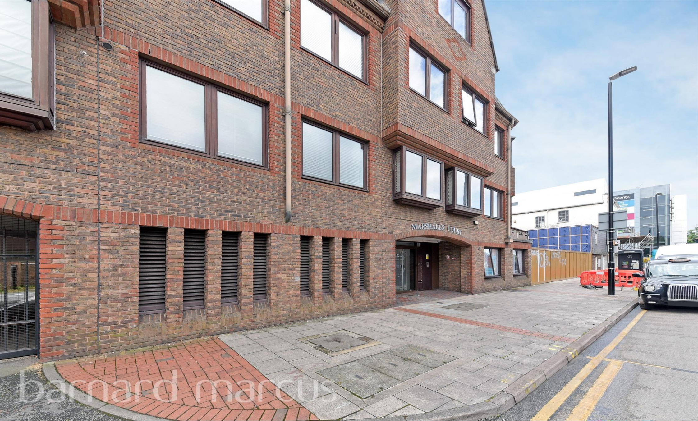
Marshalls Court Marshalls Road, Sutton SM1 4DU