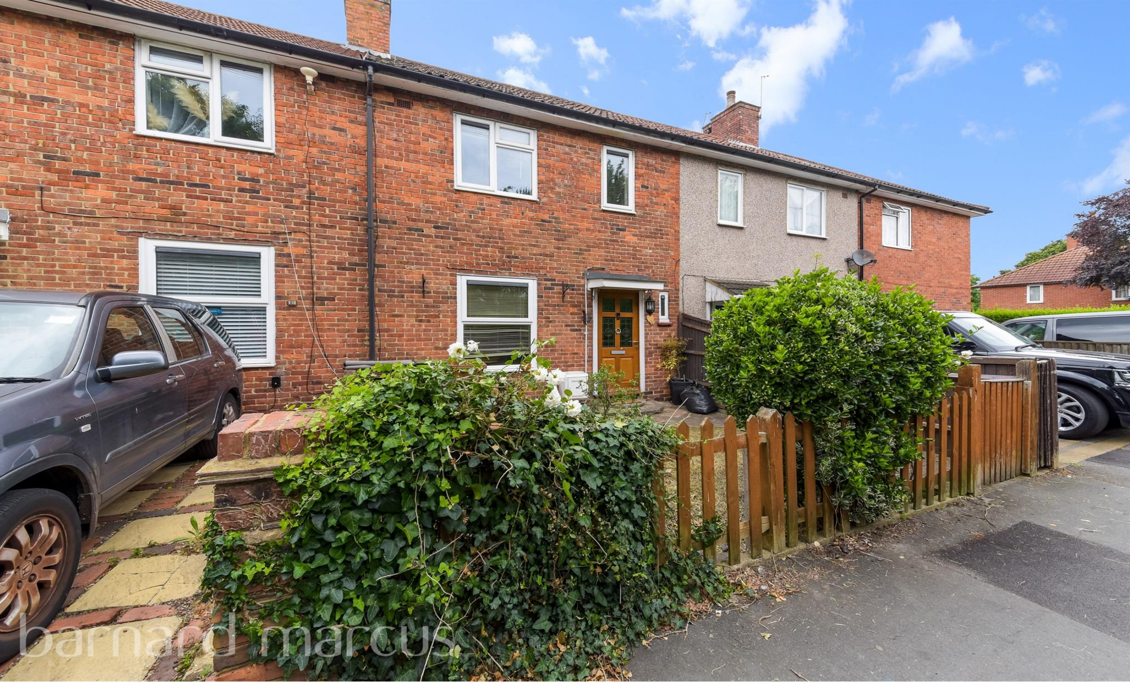
Robertsbridge Road, Carshalton SM5 1AH