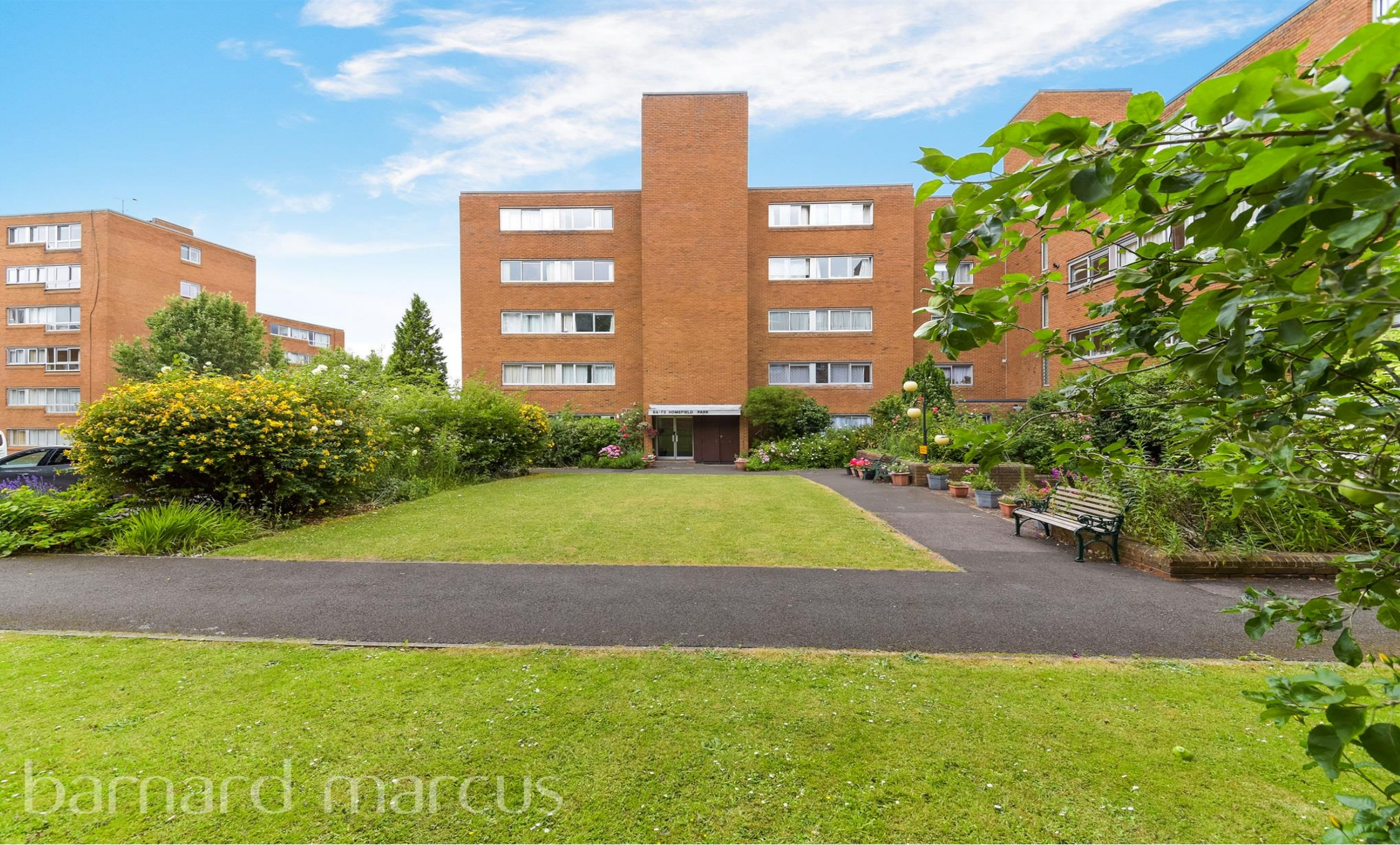
Homefield Park, Sutton SM1 2AN