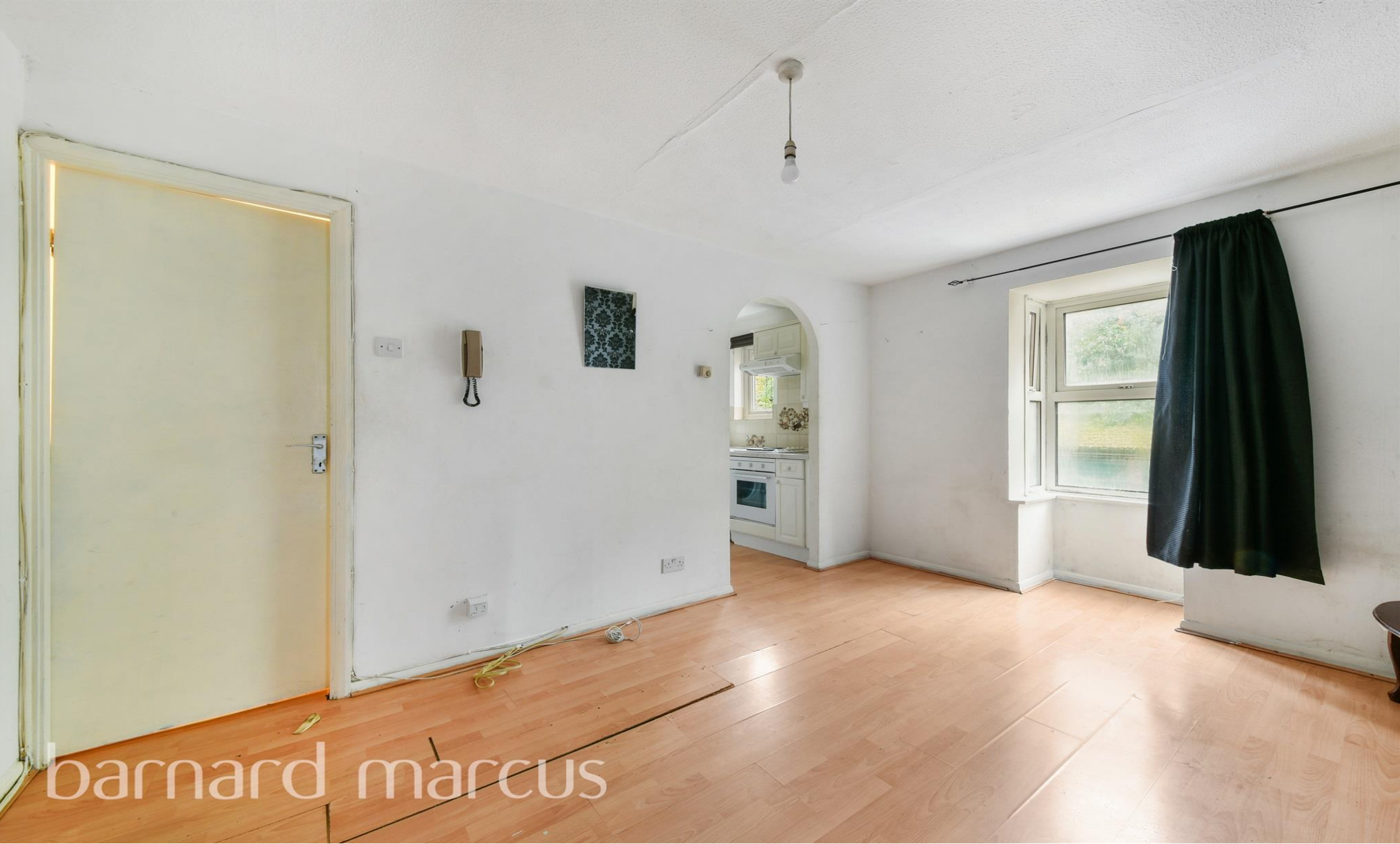
Turnpike Lane, Sutton SM1 4HB