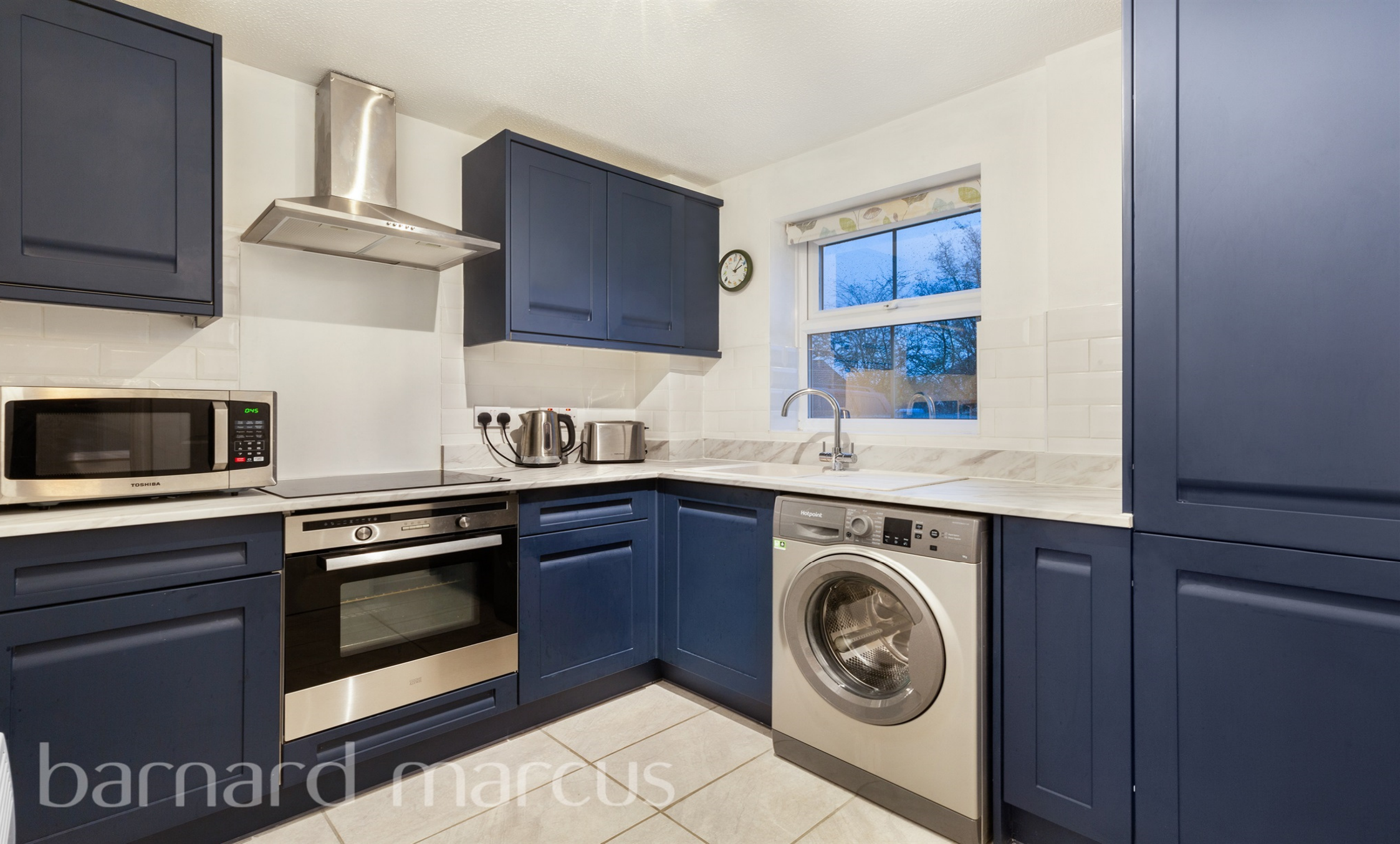
Hatfield Close, Sutton SM2 5BH