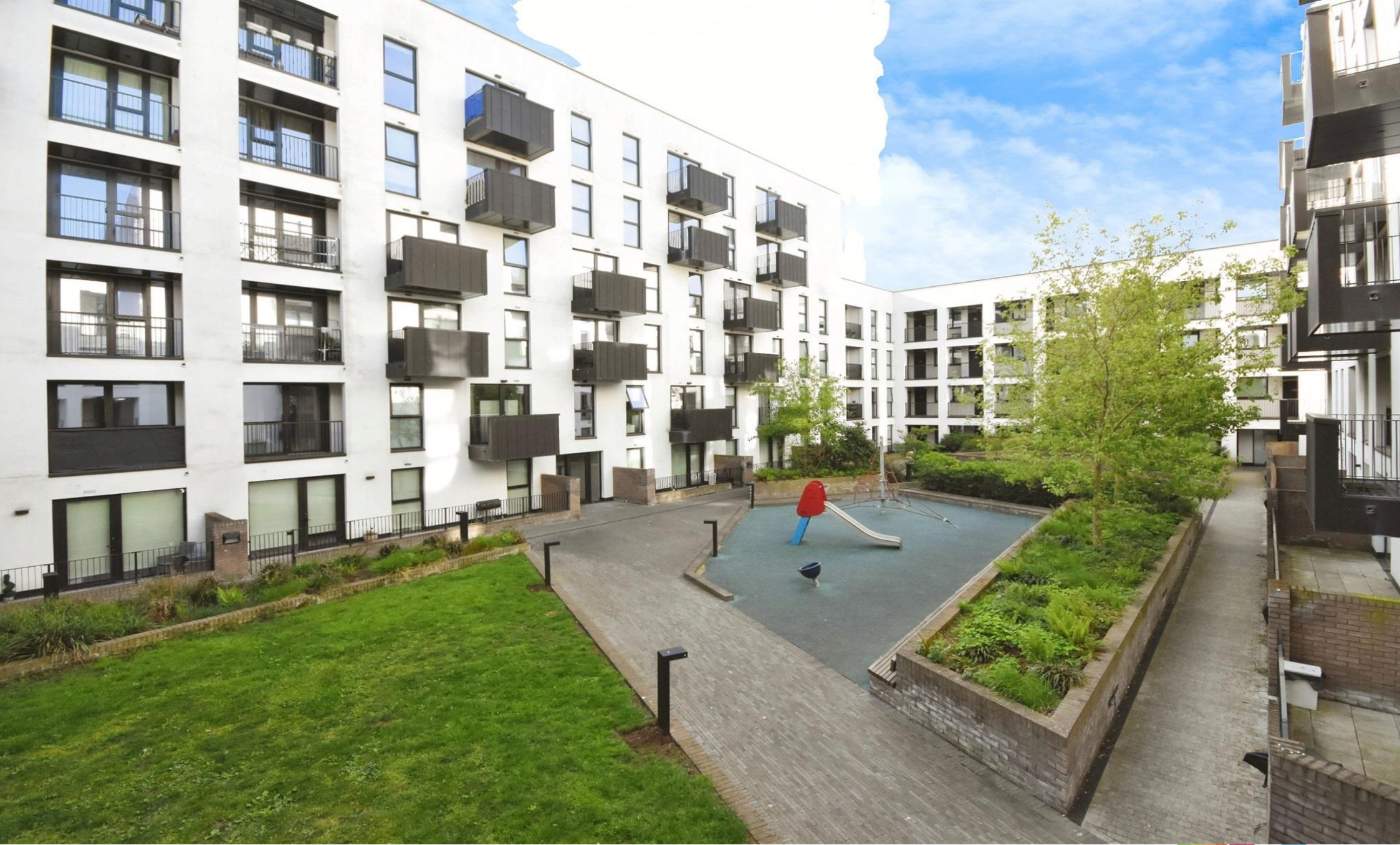
Eccles Court, Burgess Springs, CHELMSFORD CM1 1JB