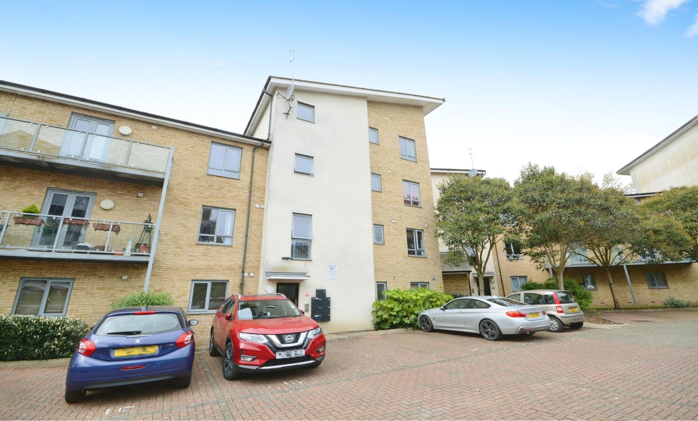
Wicks Place, Chelmsford CM1 2GH