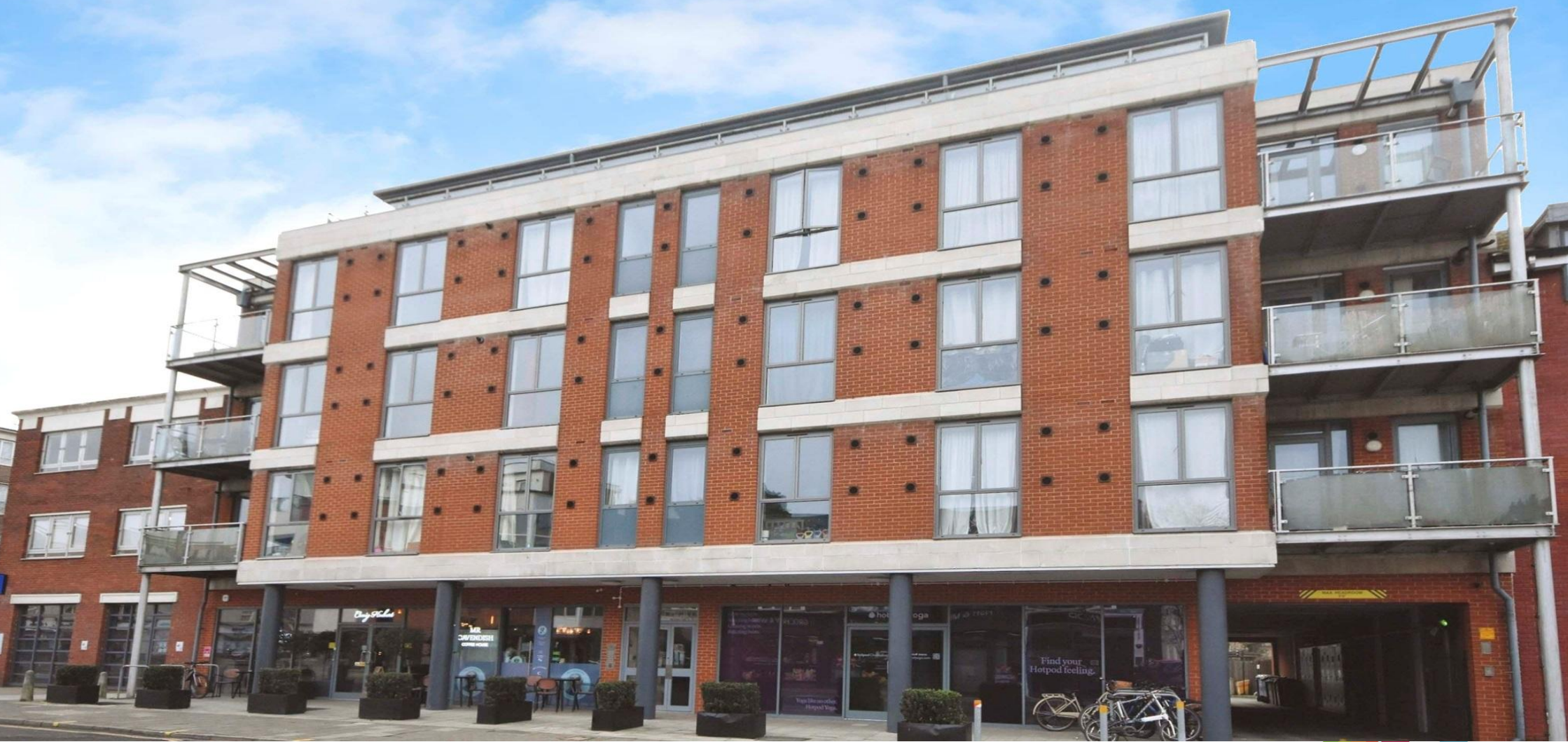
Lesley Court, Rainsford Road, Chelmsford CM1 2WS