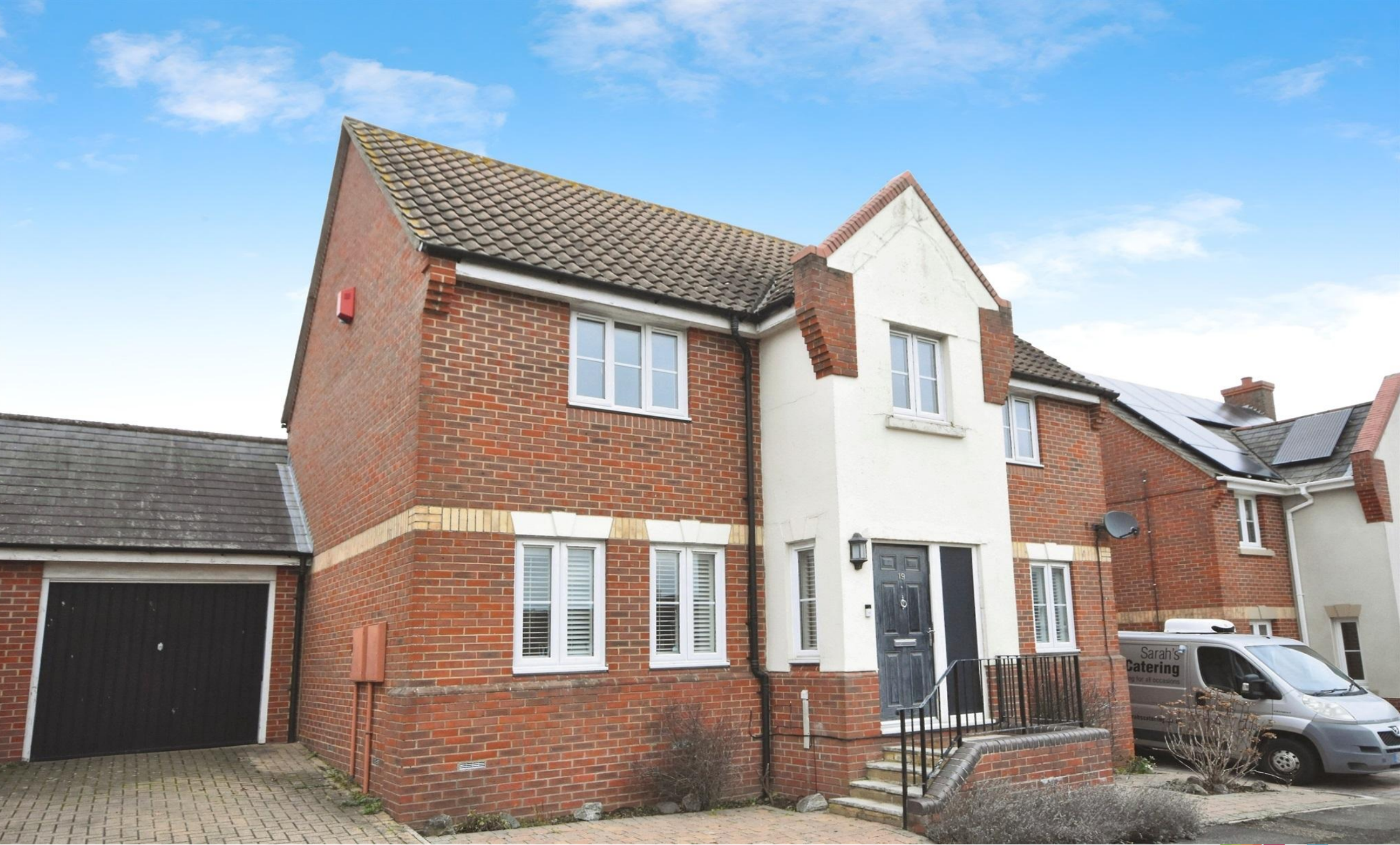
Stanley Rise, Chelmer Village, Chelmsford CM2 6PJ