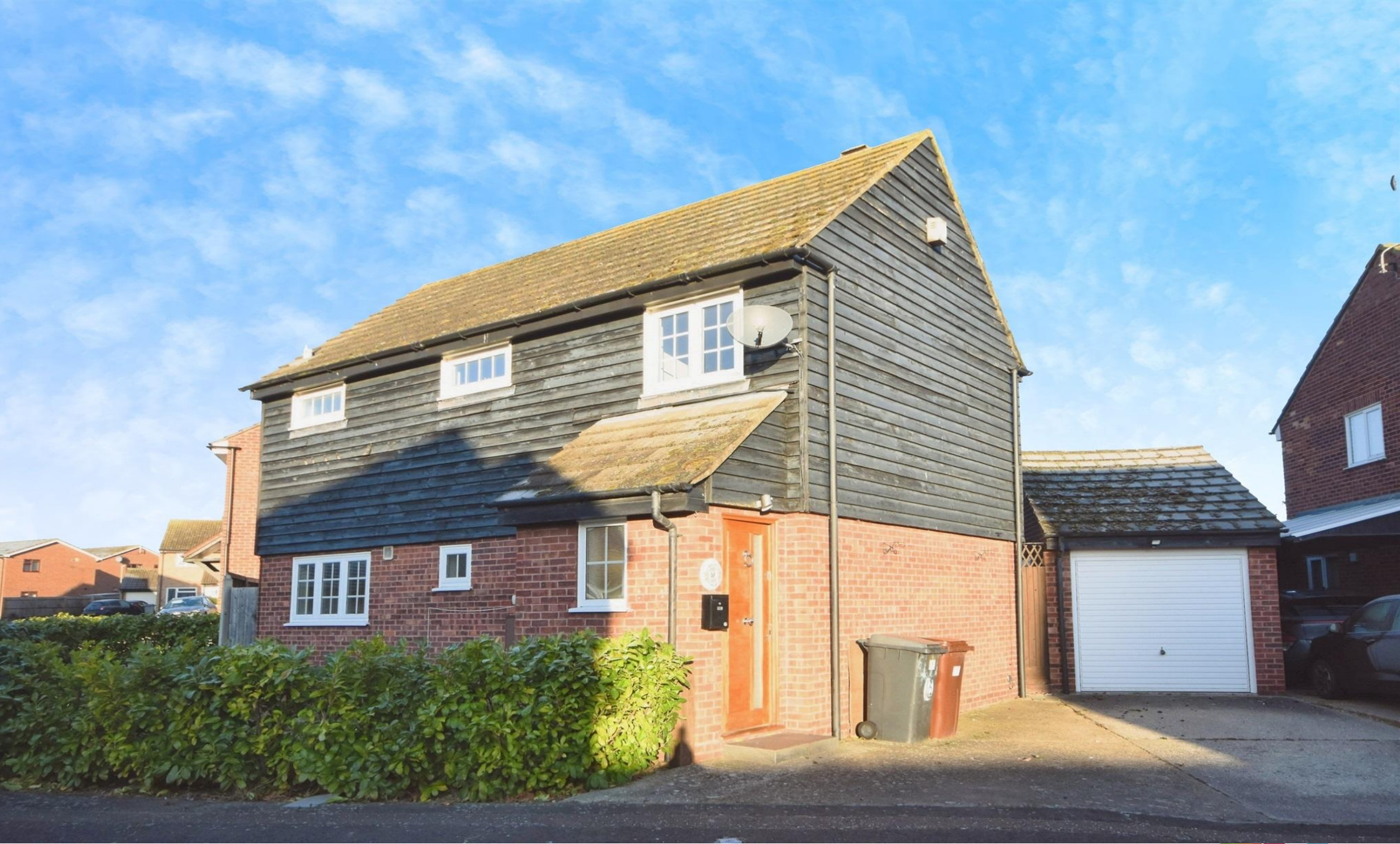
Hollis Lock, Chelmsford CM2 6RR