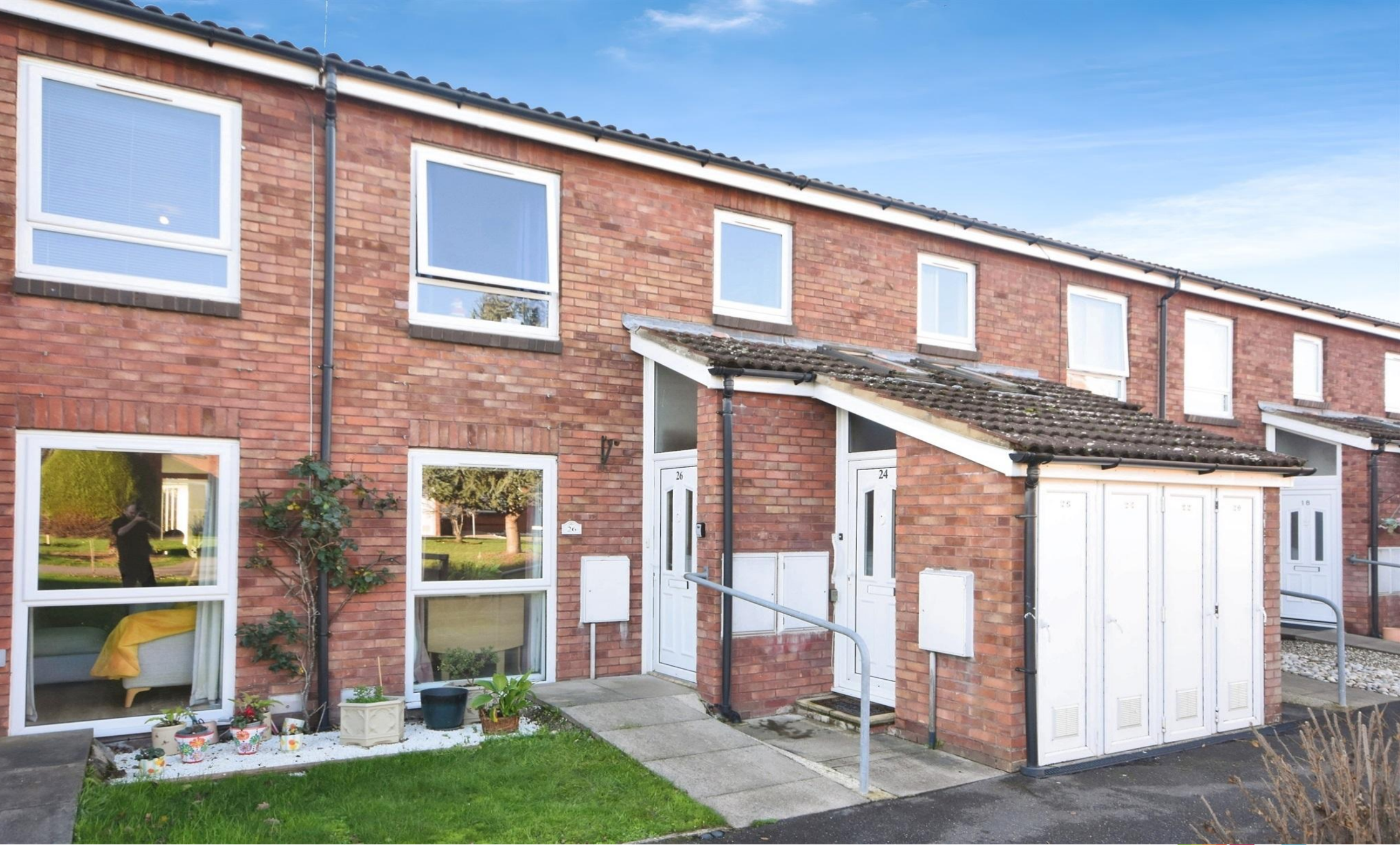
Nicholas Court, Chelmsford CM1 4XE