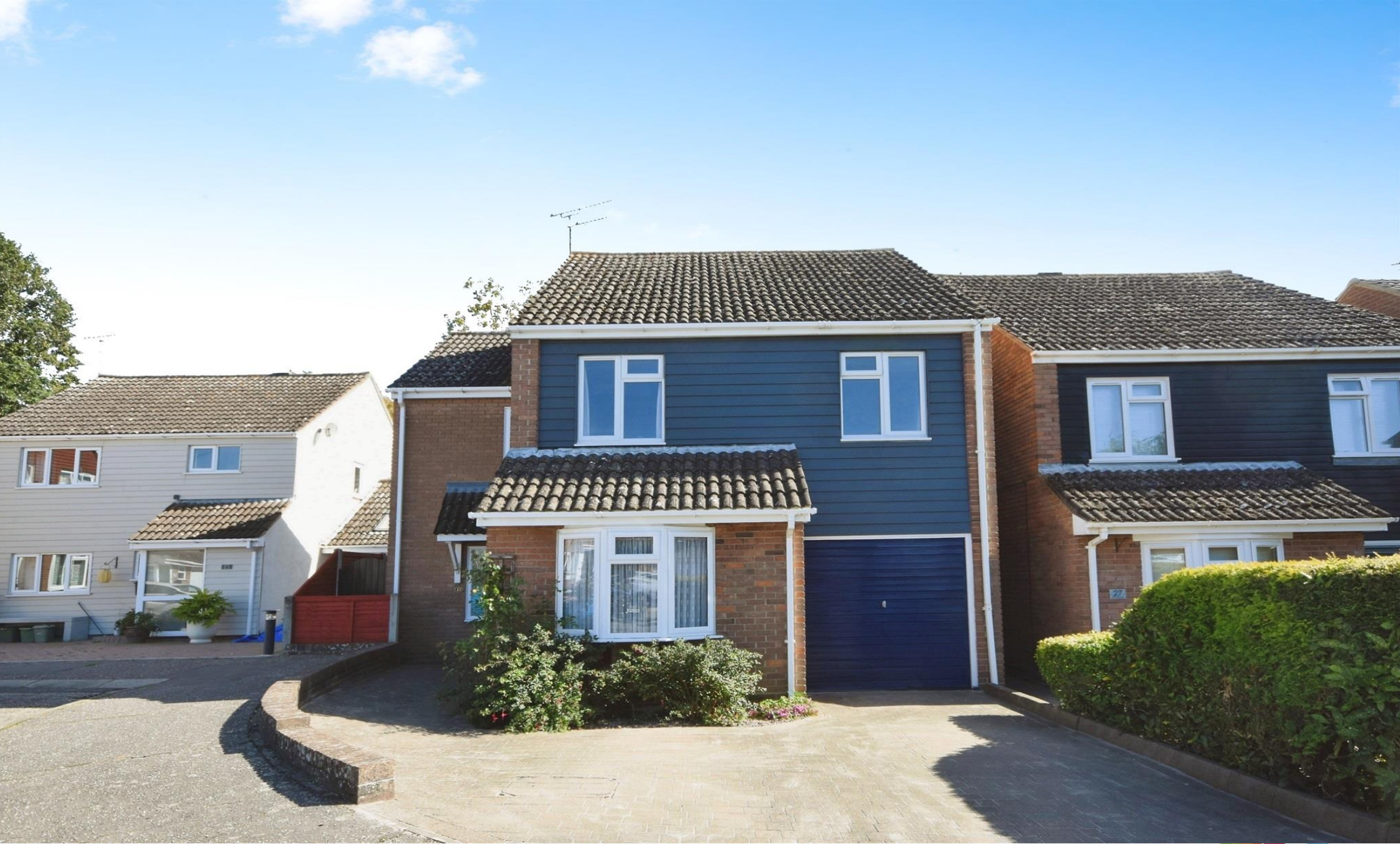
The Willows, Boreham Chelmsford CM3 3DJ