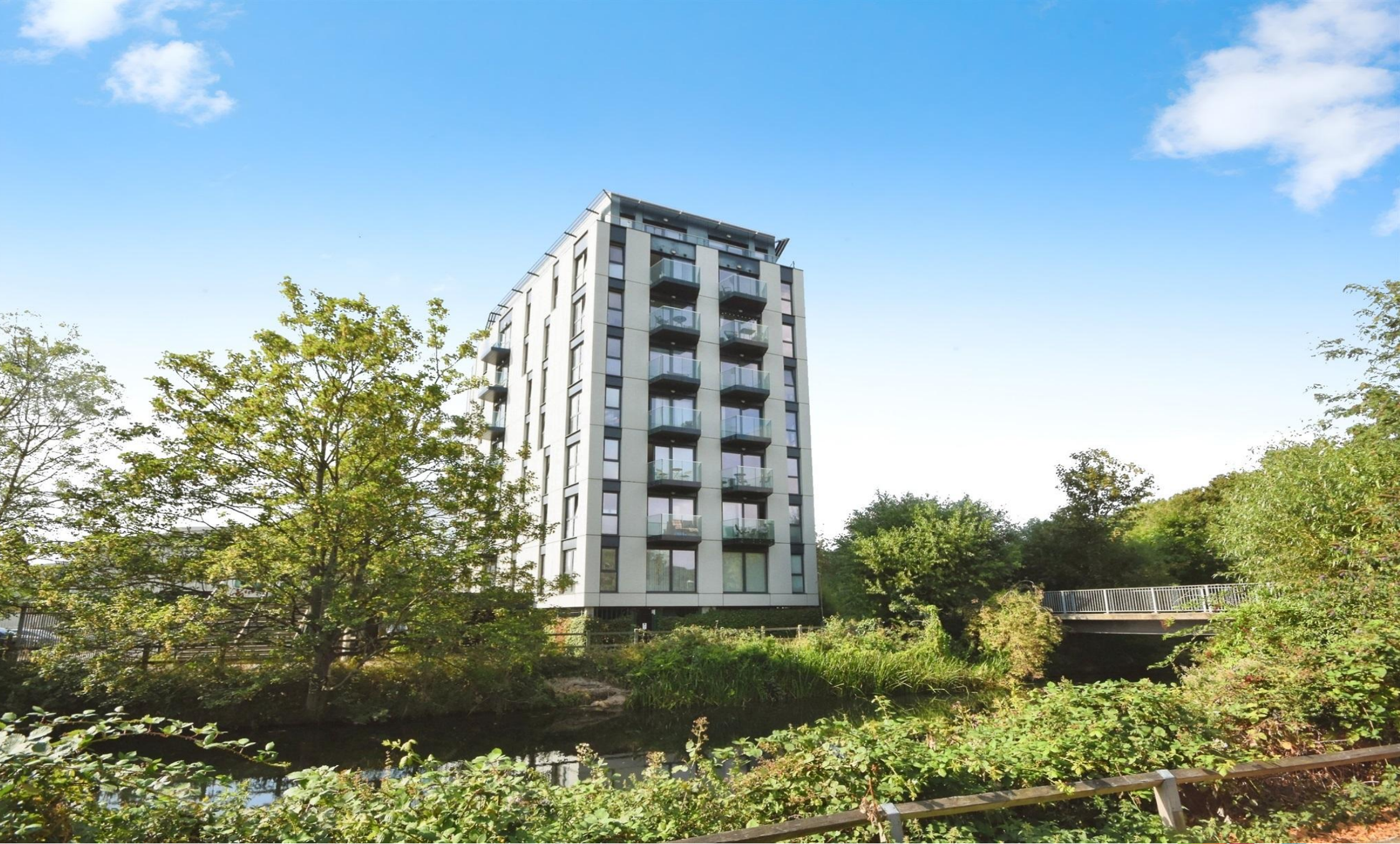
Century Tower, Shire Gate, Chelmsford CM2 0FQ