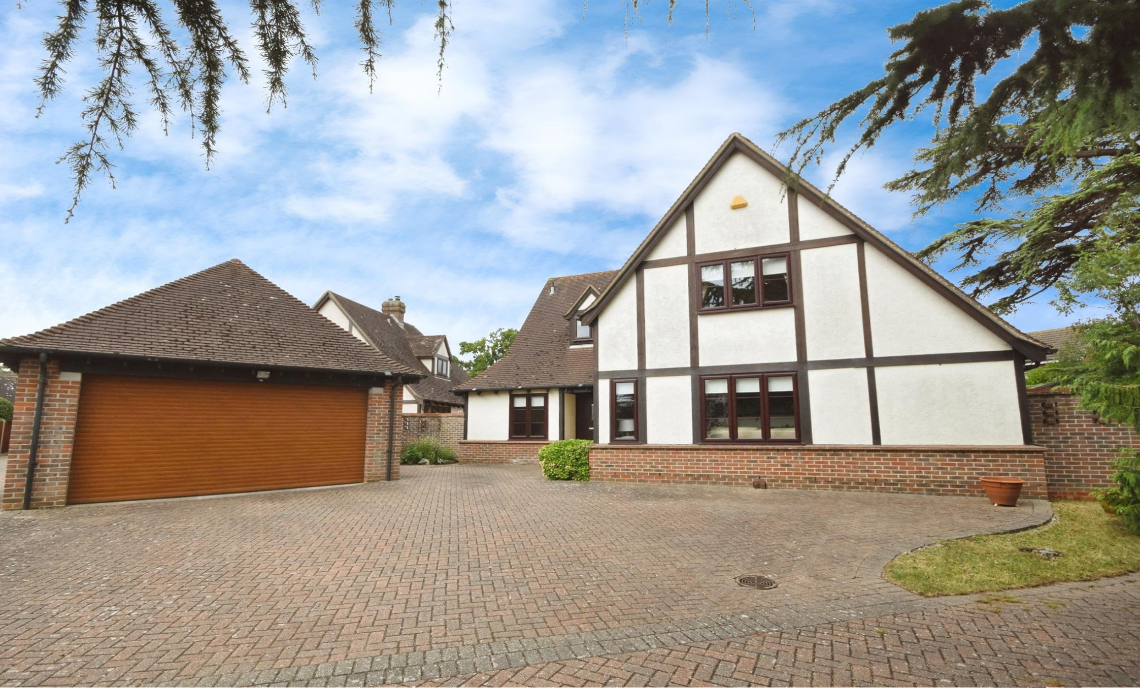
Oak Lodge Tye, Springfield Chelmsford CM1 6GY