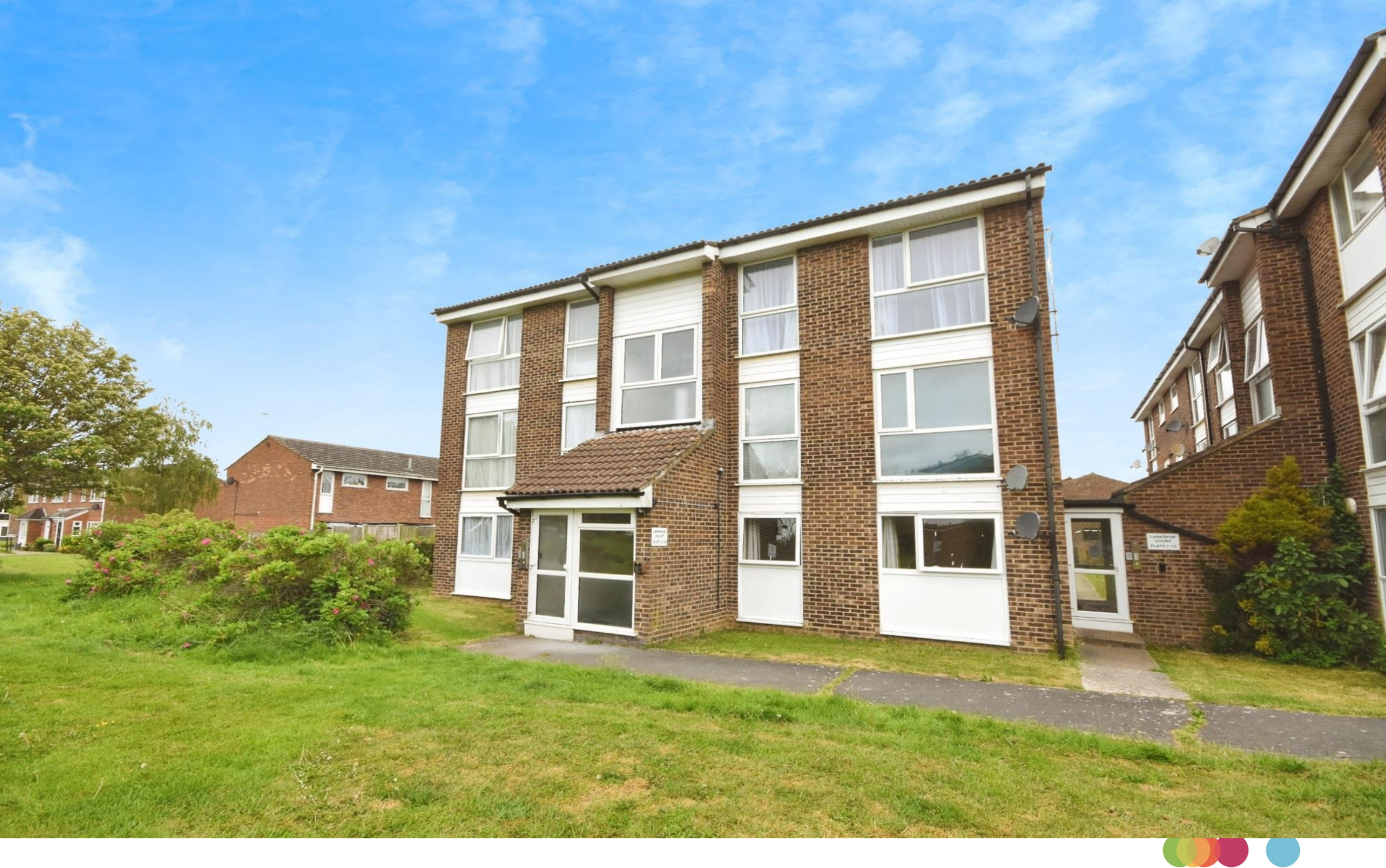
Larkspur Court, Candytuft Road, Chelmsford CM1 6QX