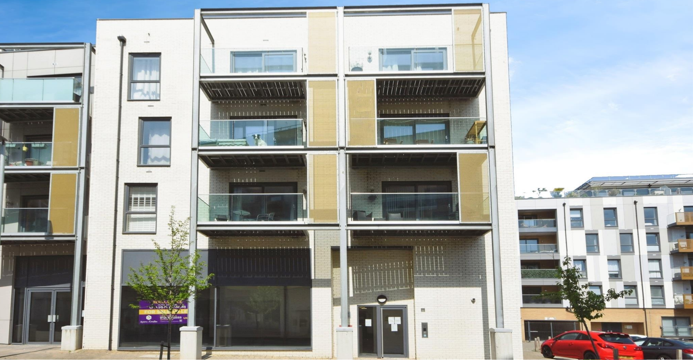
Cunard Square, Chelmsford CM1 1AQ