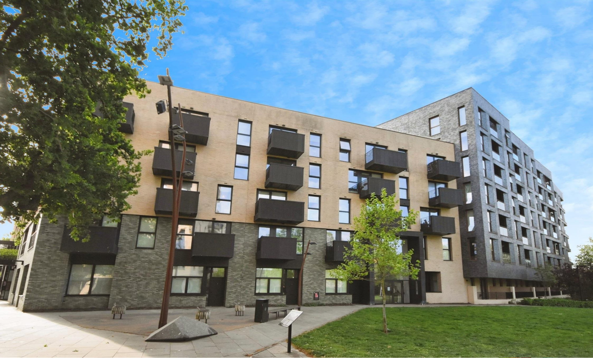
Eccles Court, Burgess Springs, CHELMSFORD CM1 1JB