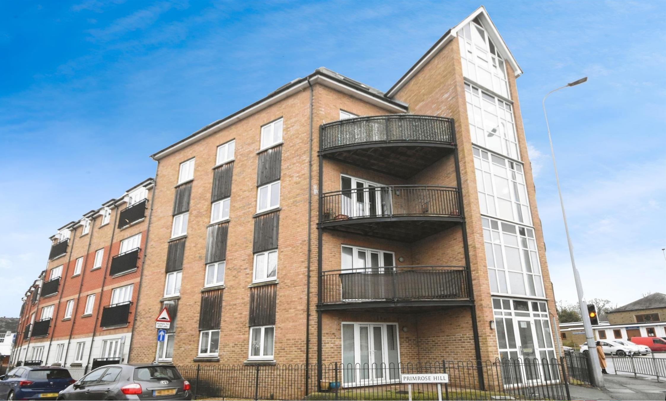
Primula Court, Primrose Hill, Chelmsford CM1 2FZ