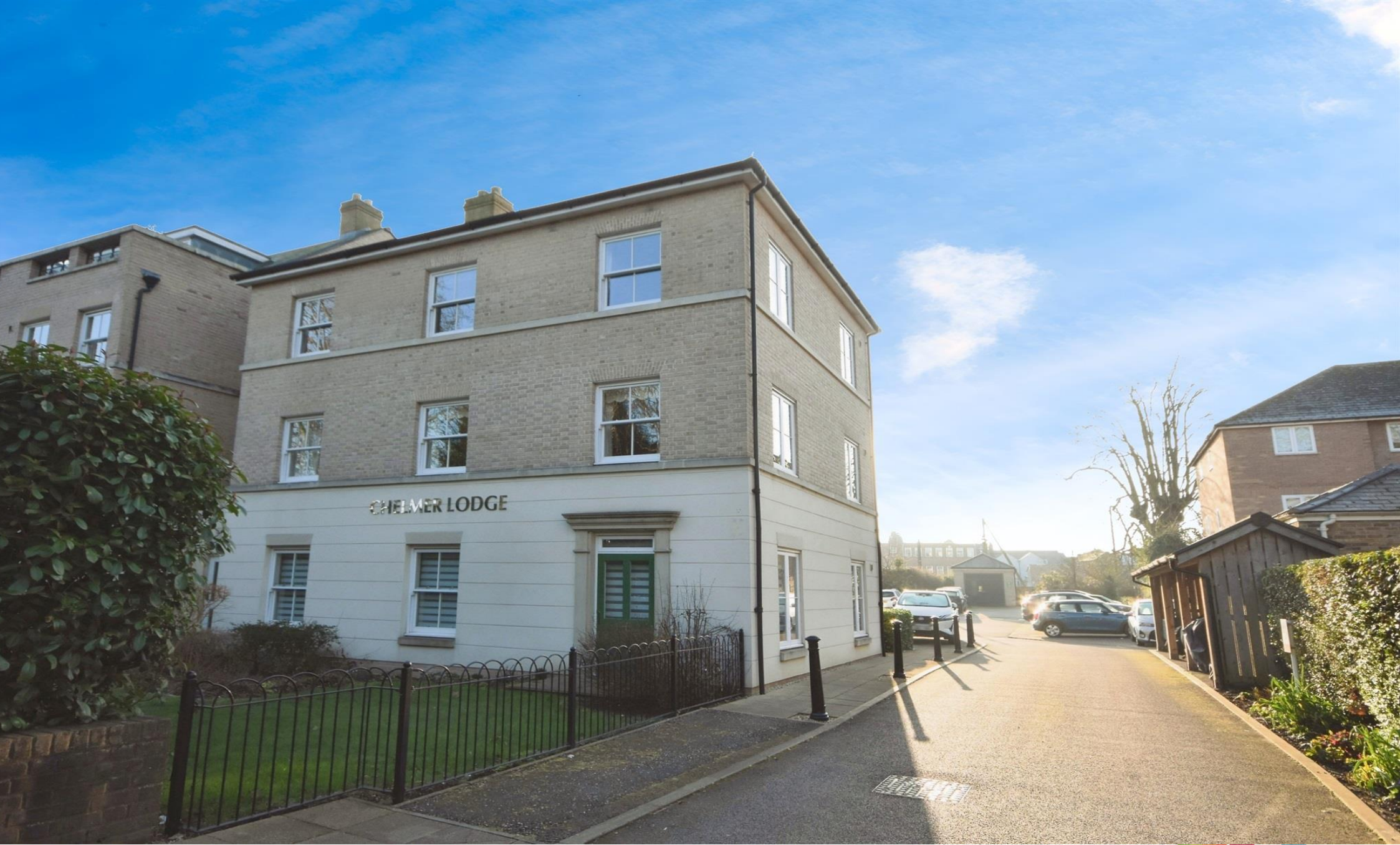
Chelmer Lodge, New London Road, Chelmsford CM2 0FY