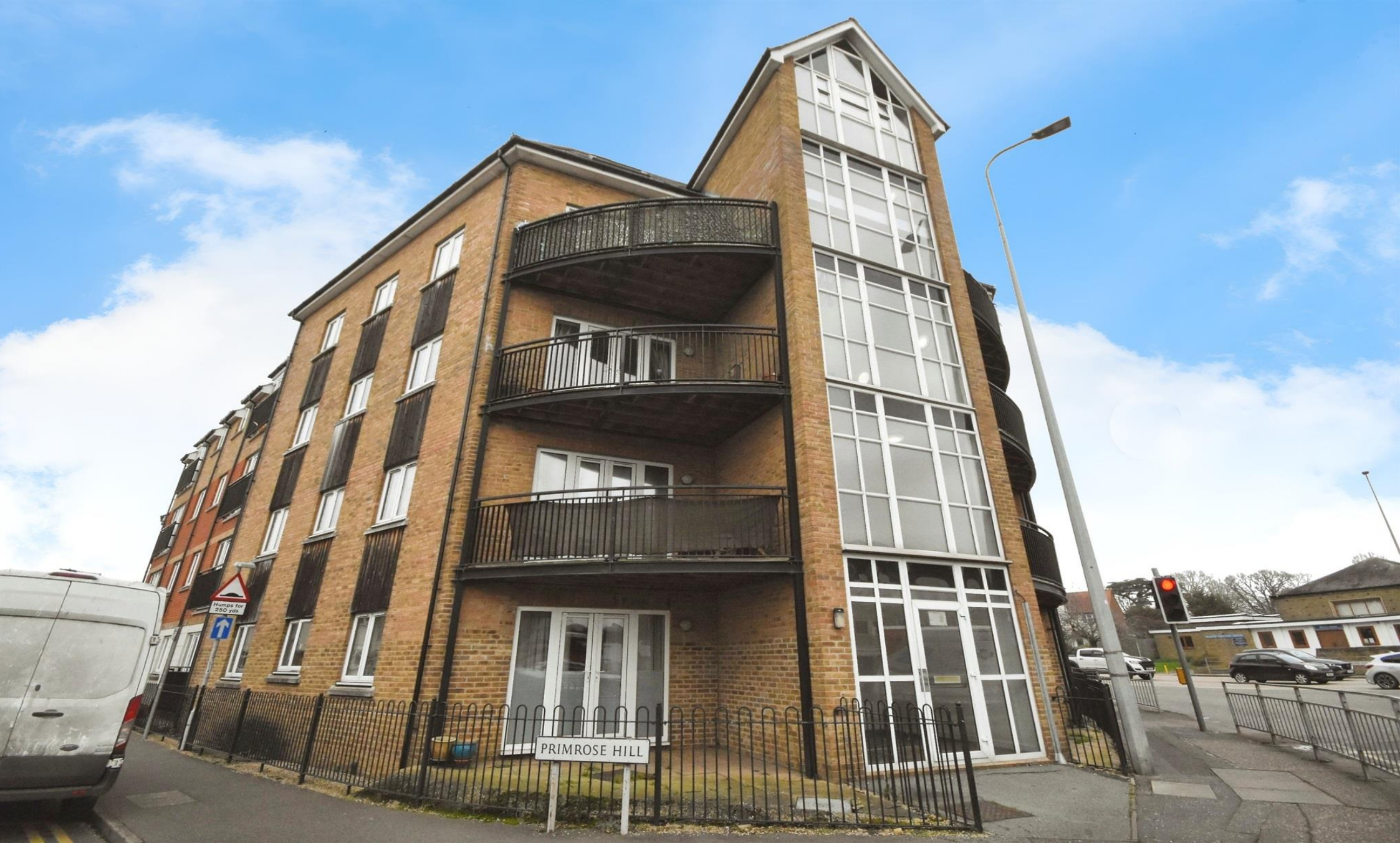
Primula Court Primrose Hill, CHELMSFORD CM1 2FZ