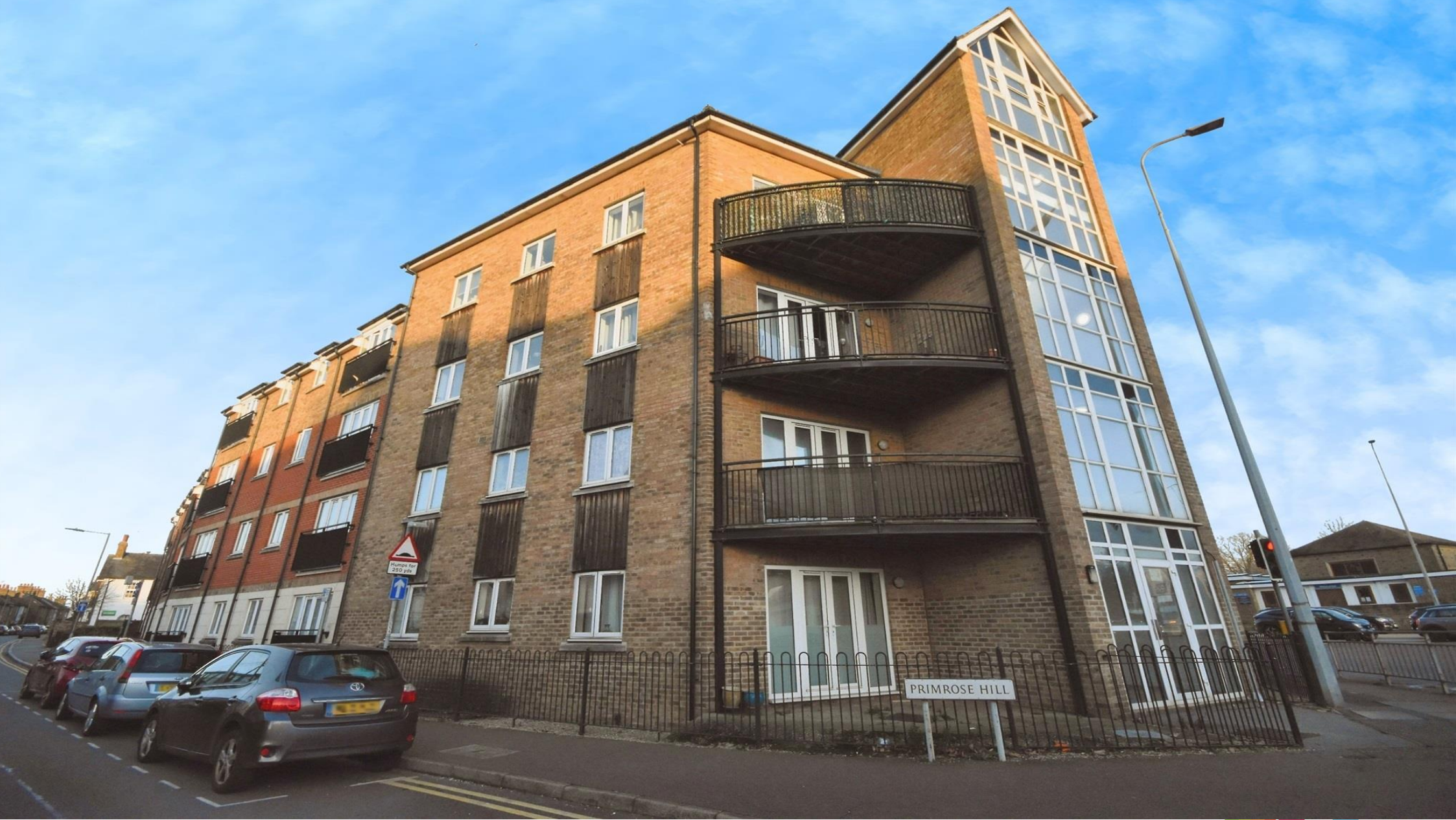
Primula Court, Primrose Hill, Chelmsford CM1 2FZ