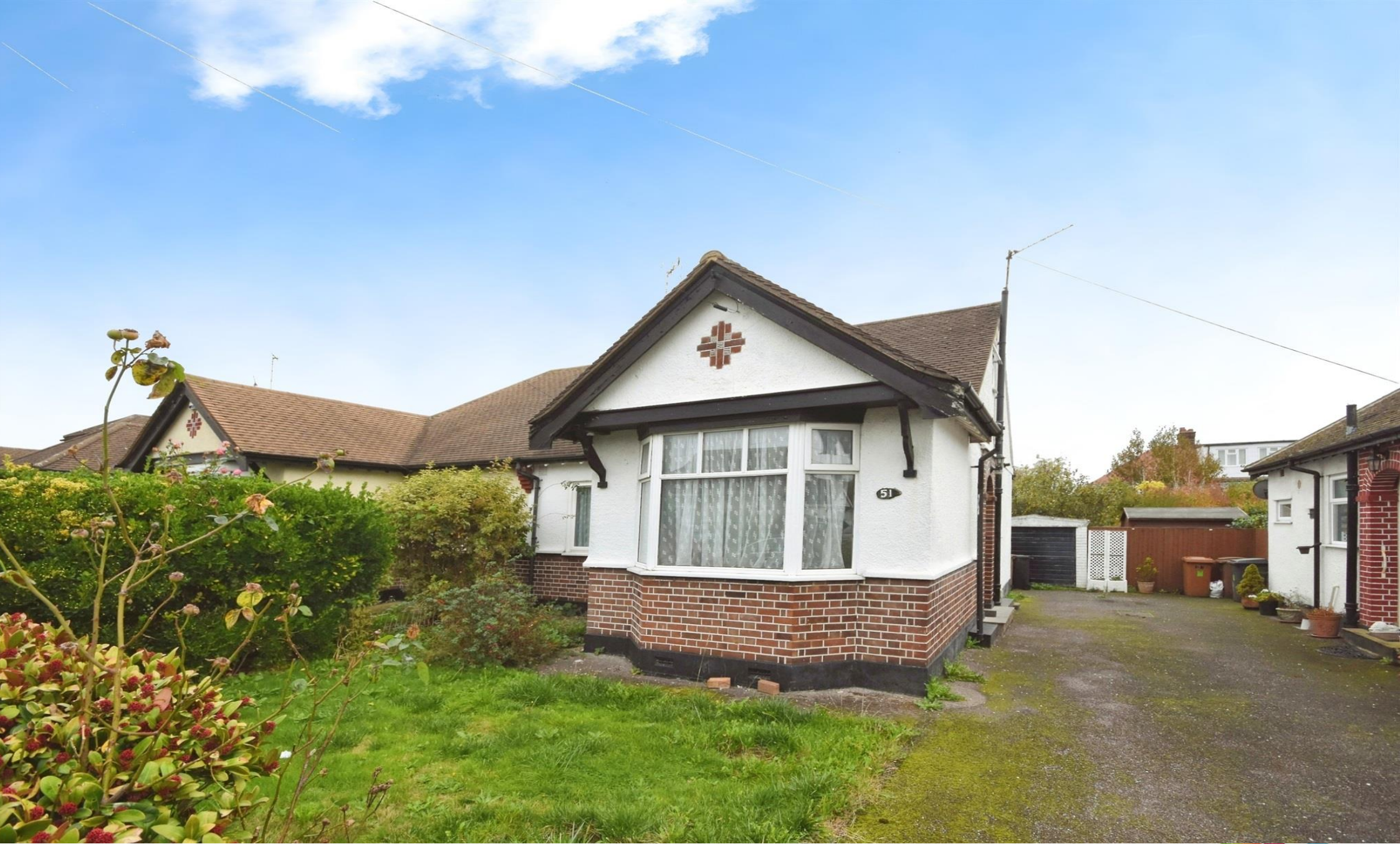
Nalla Gardens, Broomfield Chelmsford CM1 4AU