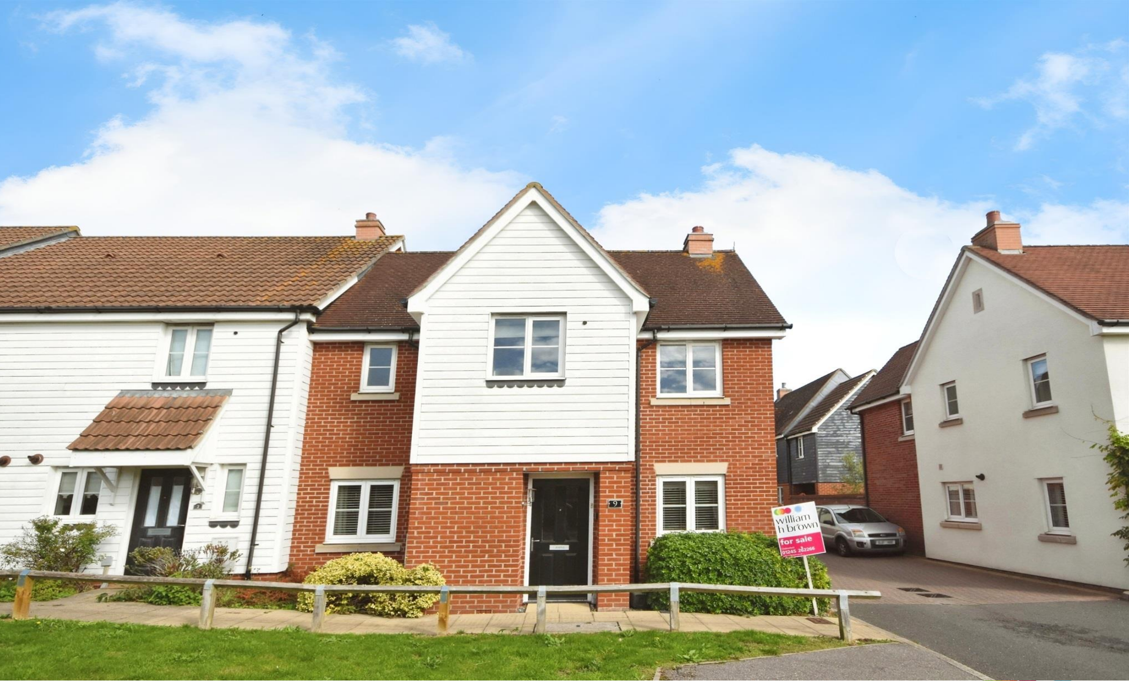
Ratcliffe Gate, Beaulieu Park Chelmsford CM1 6AL