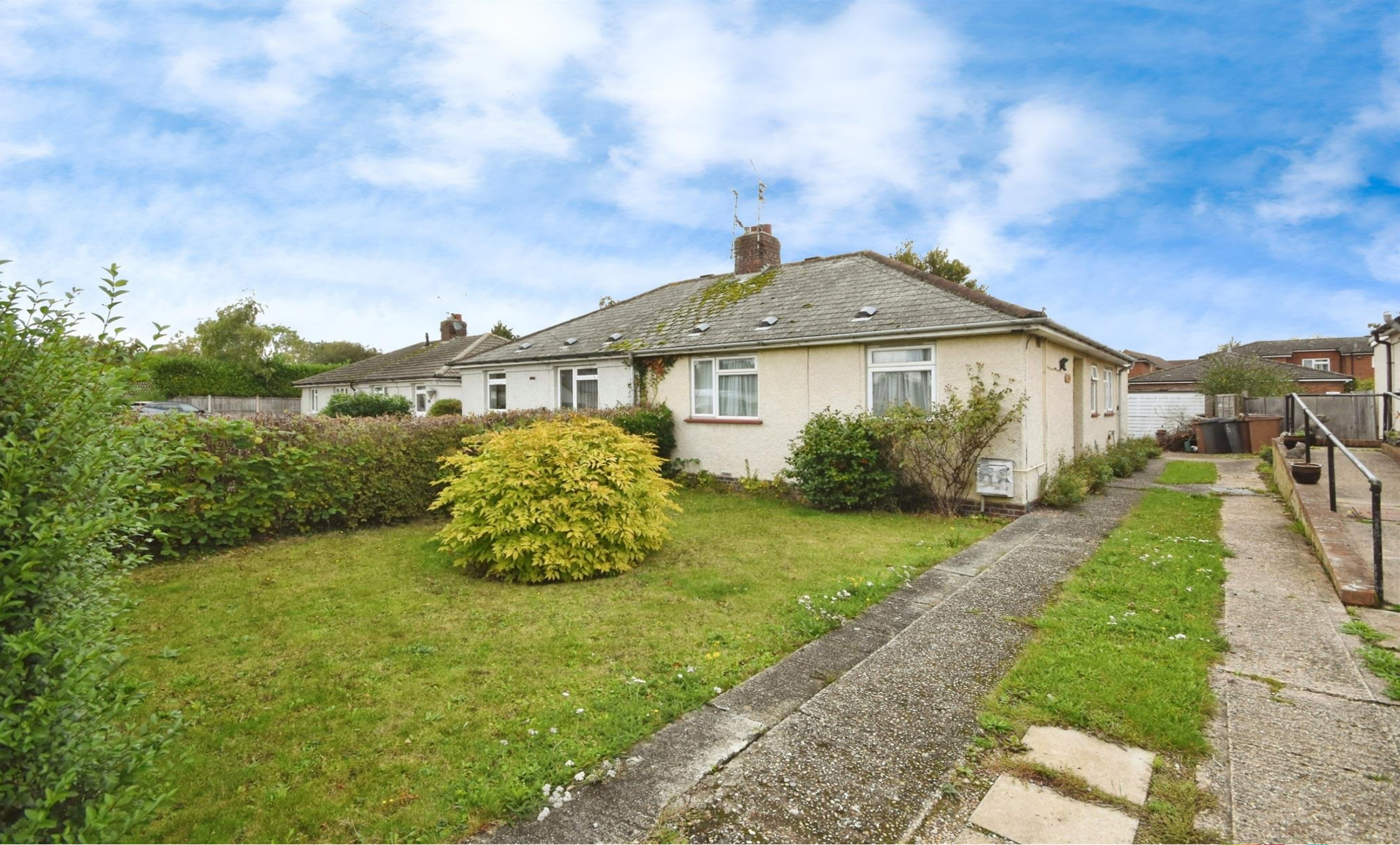
Elm Way, Boreham, Chelmsford CM3 3HD