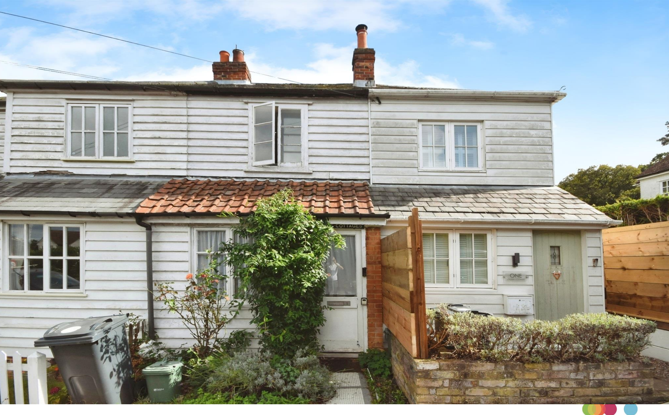
Hillside Cottages, North Hill, Little Baddow, Chelmsford CM3 4TE