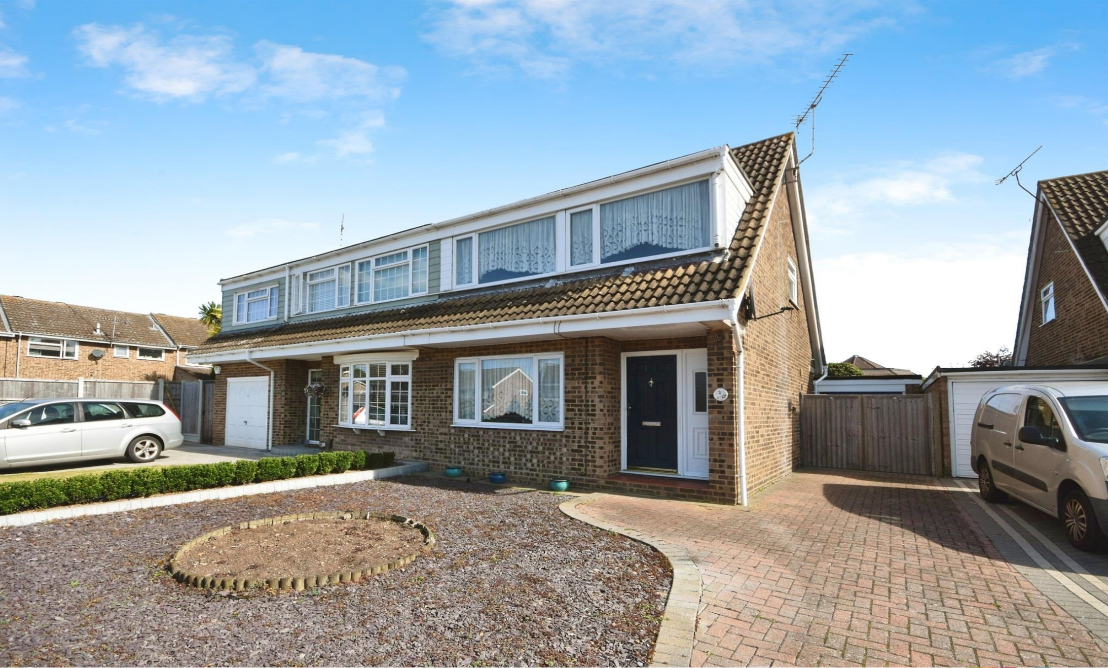
Mayne Crest, Chelmsford CM1 6UA