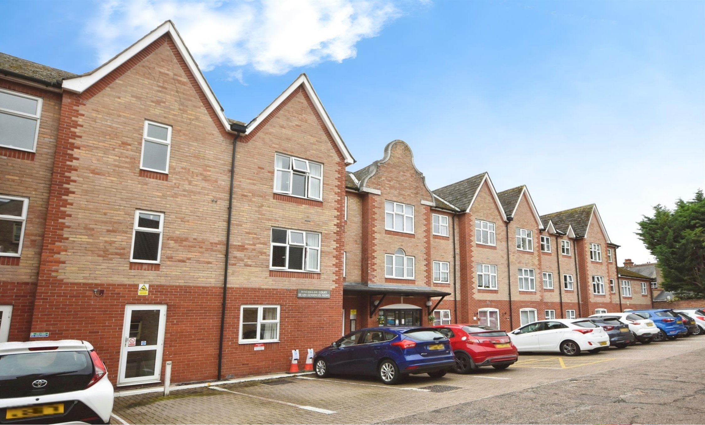
Godfreys Mews, City Centre Chelmsford CM2 0XE