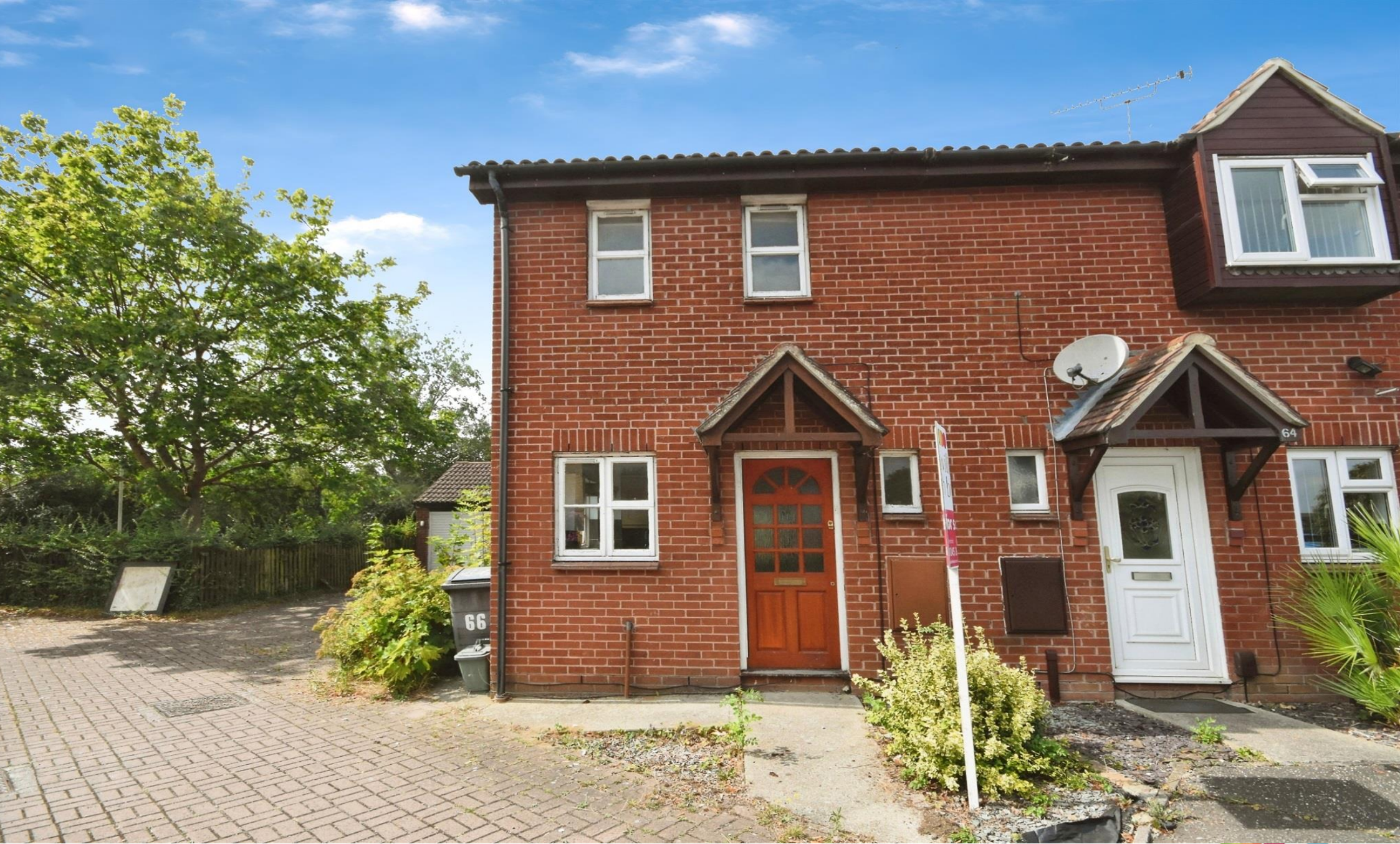
Boulderby Grove, Chelmsford CM1 4XW