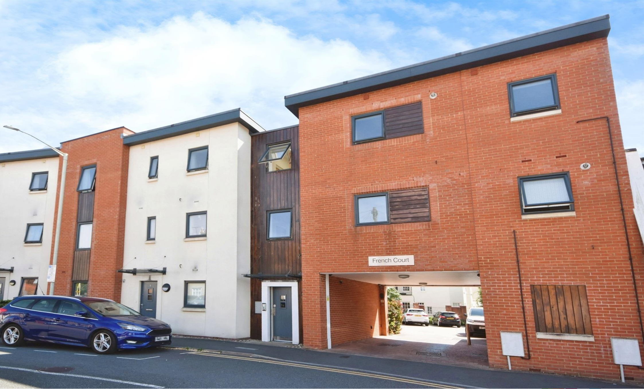
French Court, Cedar Avenue, Chelmsford CM1 2WW