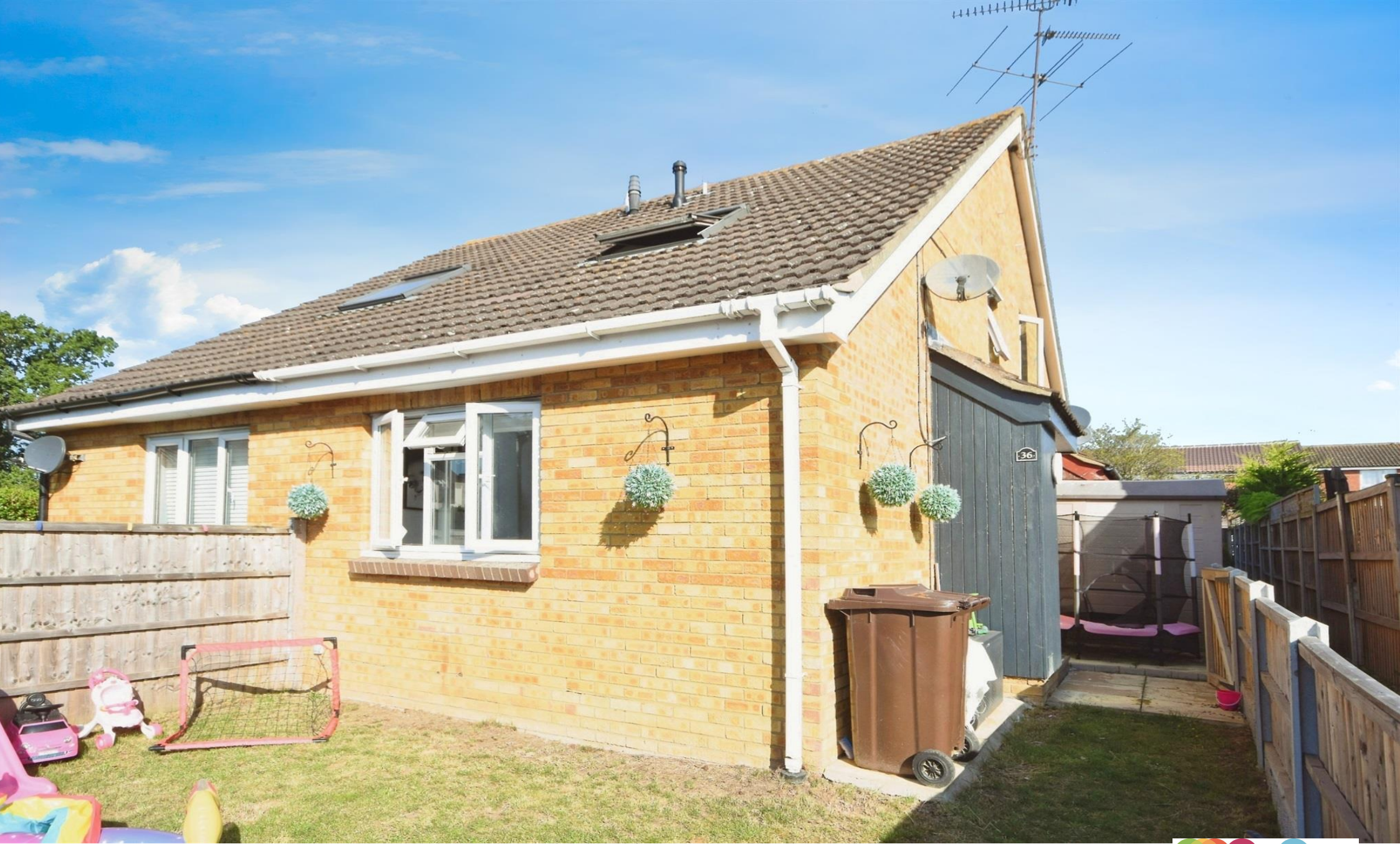
Bonington Chase, CHELMSFORD CM1 6GB