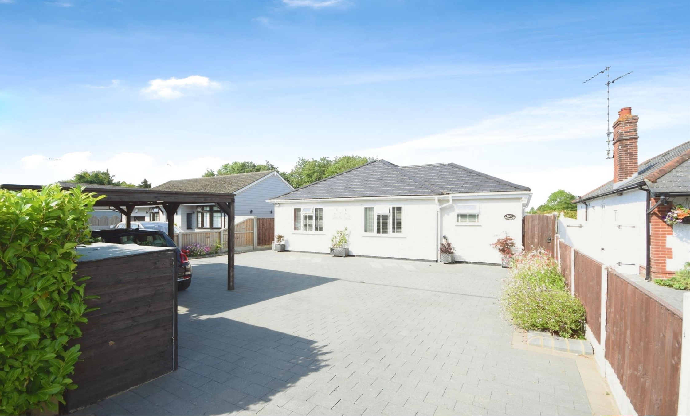
Belverdere, Boyton Cross, Roxwell, Chelmsford CM1 4LP