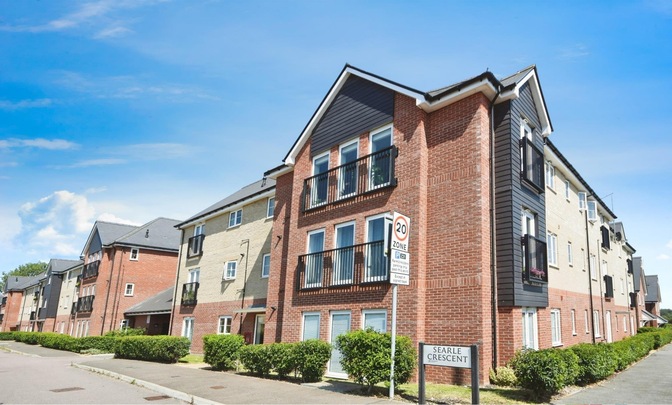
Searle Crescent, Broomfield, Chelmsford CM1 7FN