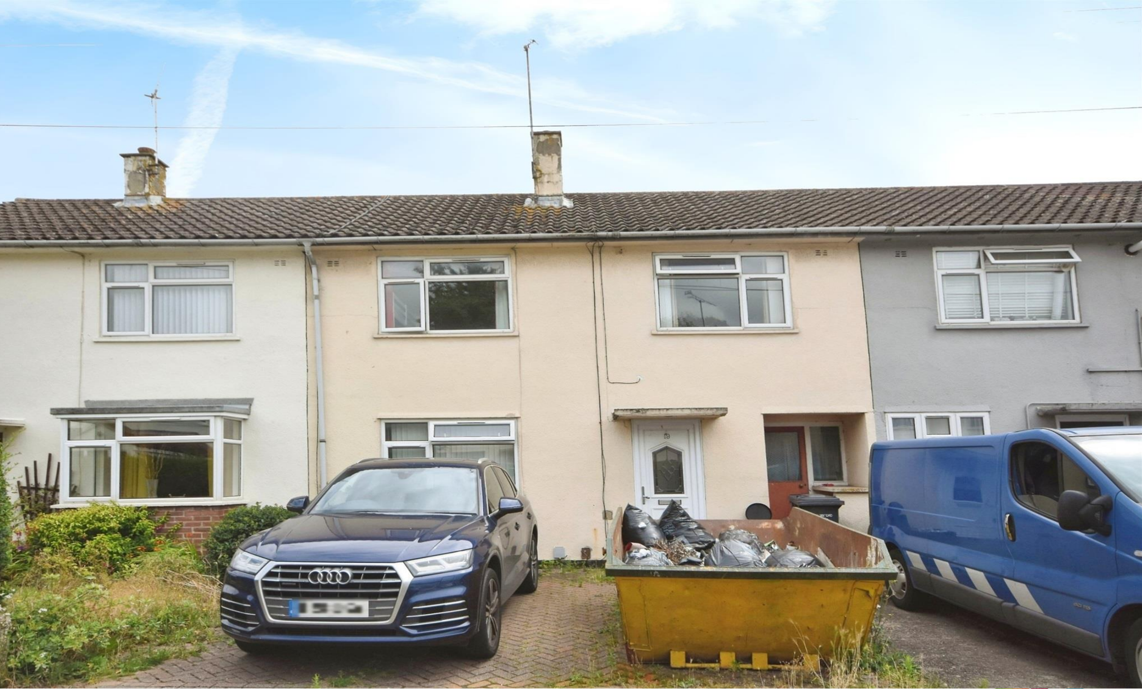
Milburn Crescent, Chelmsford CM1 3DA