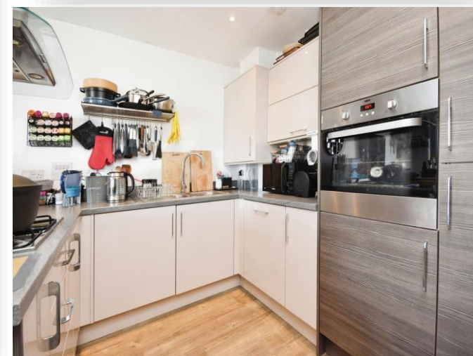
Watson Heights, City Centre Chelmsford CM1 1AG