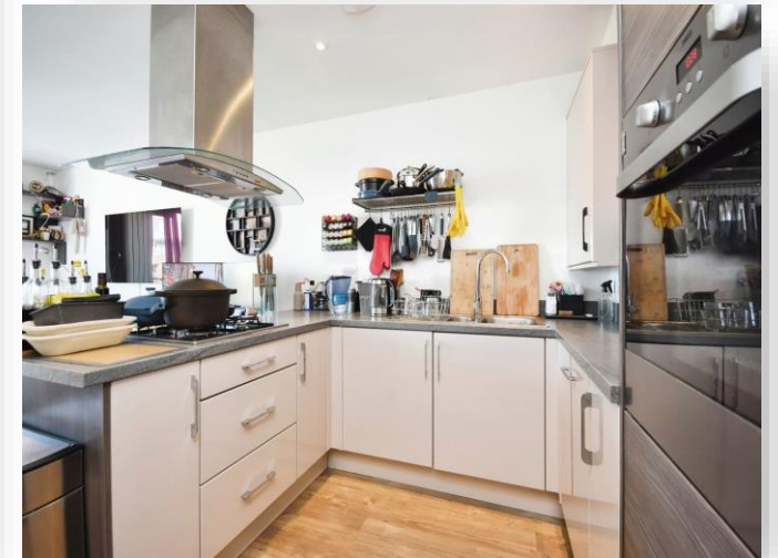
Watson Heights, City Centre Chelmsford CM1 1AG