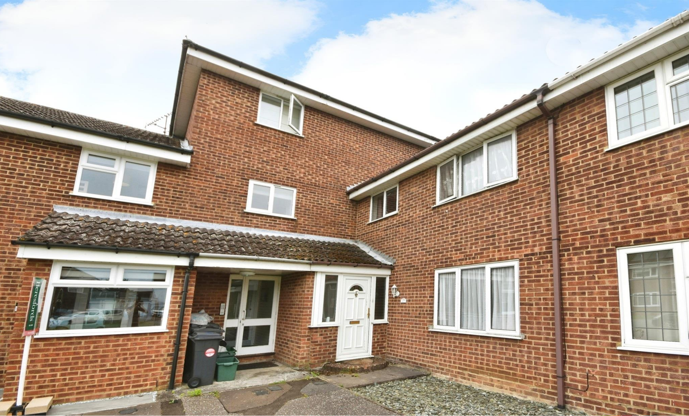
Forefield Green, Chelmsford CM1 6YU