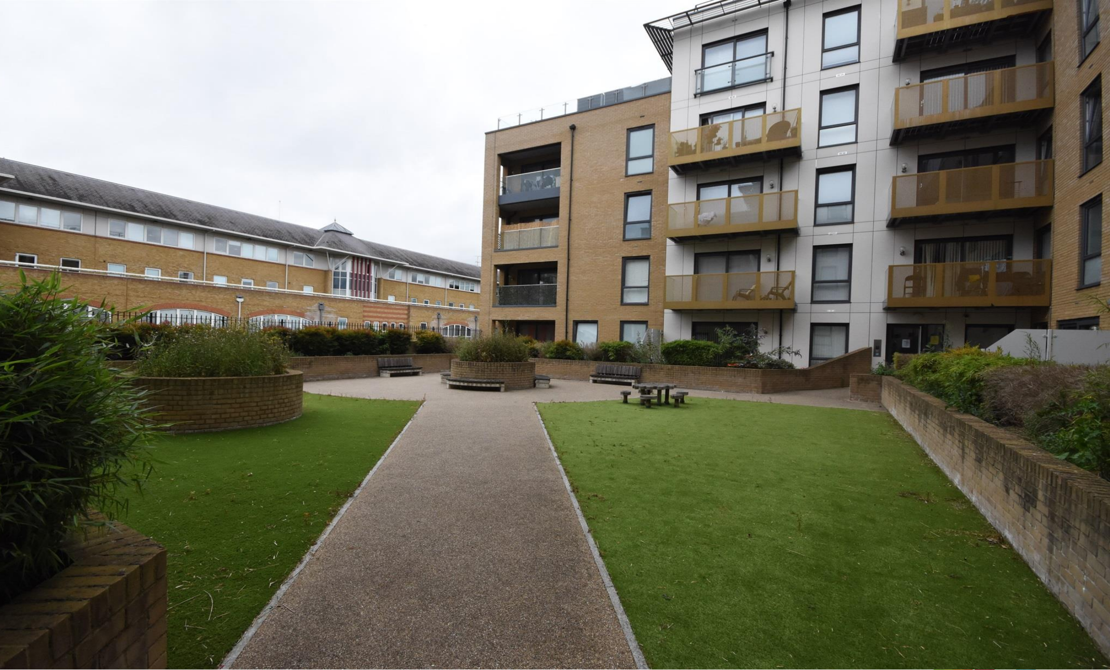
Watson Heights, Chelmsford CM1 1AP