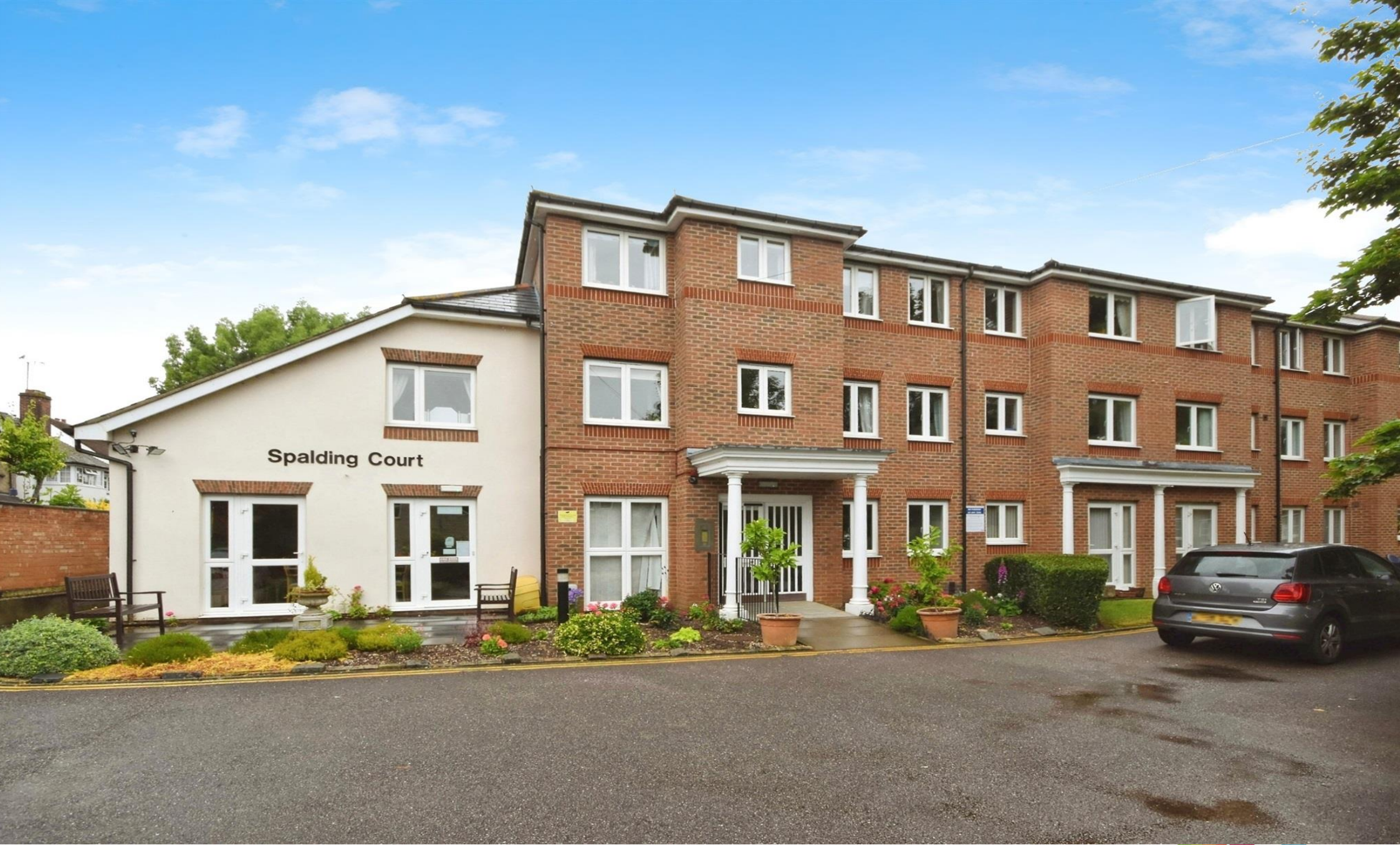
Spalding Court Cedar Avenue, Chelmsford CM1 2UZ