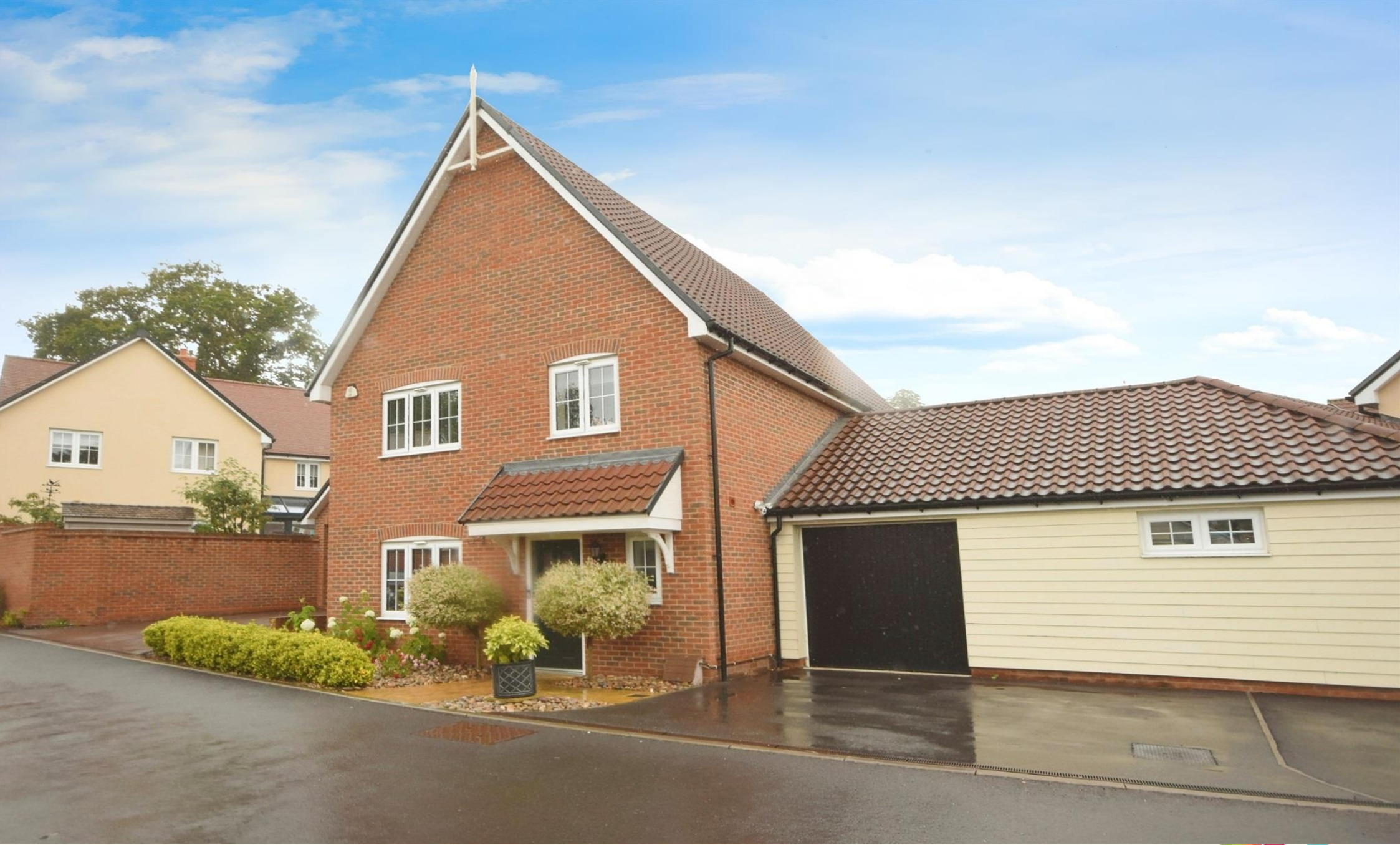
Petty Croft, Broomfield, Chelmsford CM1 7FS