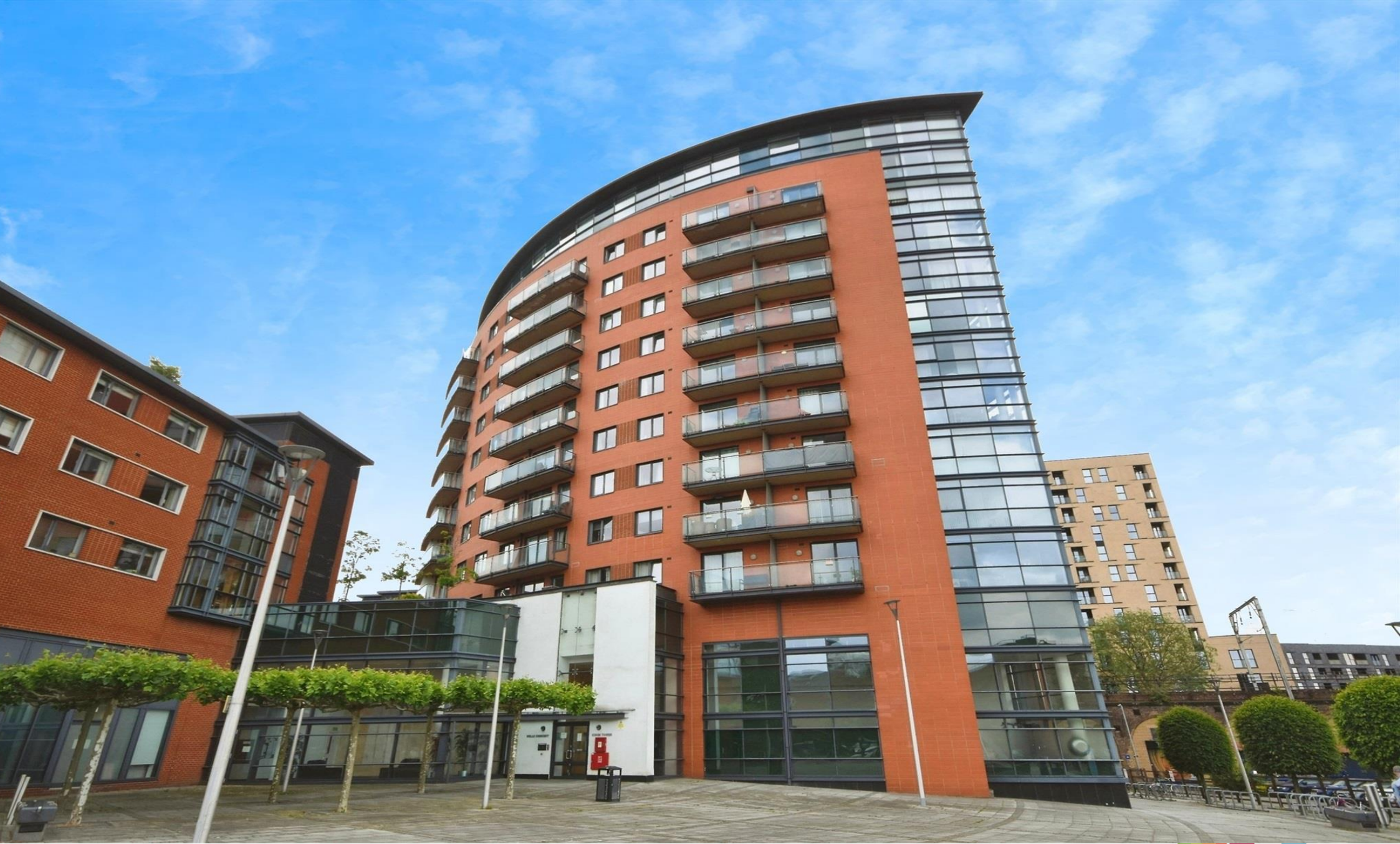
Kings Tower, Marconi Plaza, City Centre CHELMSFORD CM1 1GS