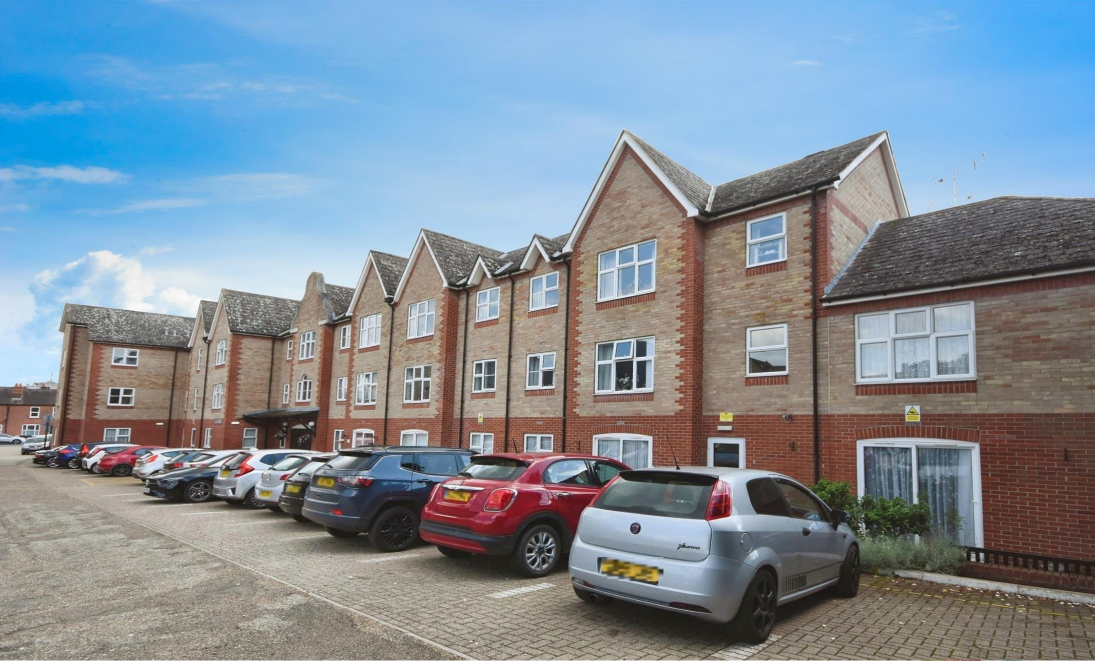
Godfreys Mews, City Centre Chelmsford CM2 0XE