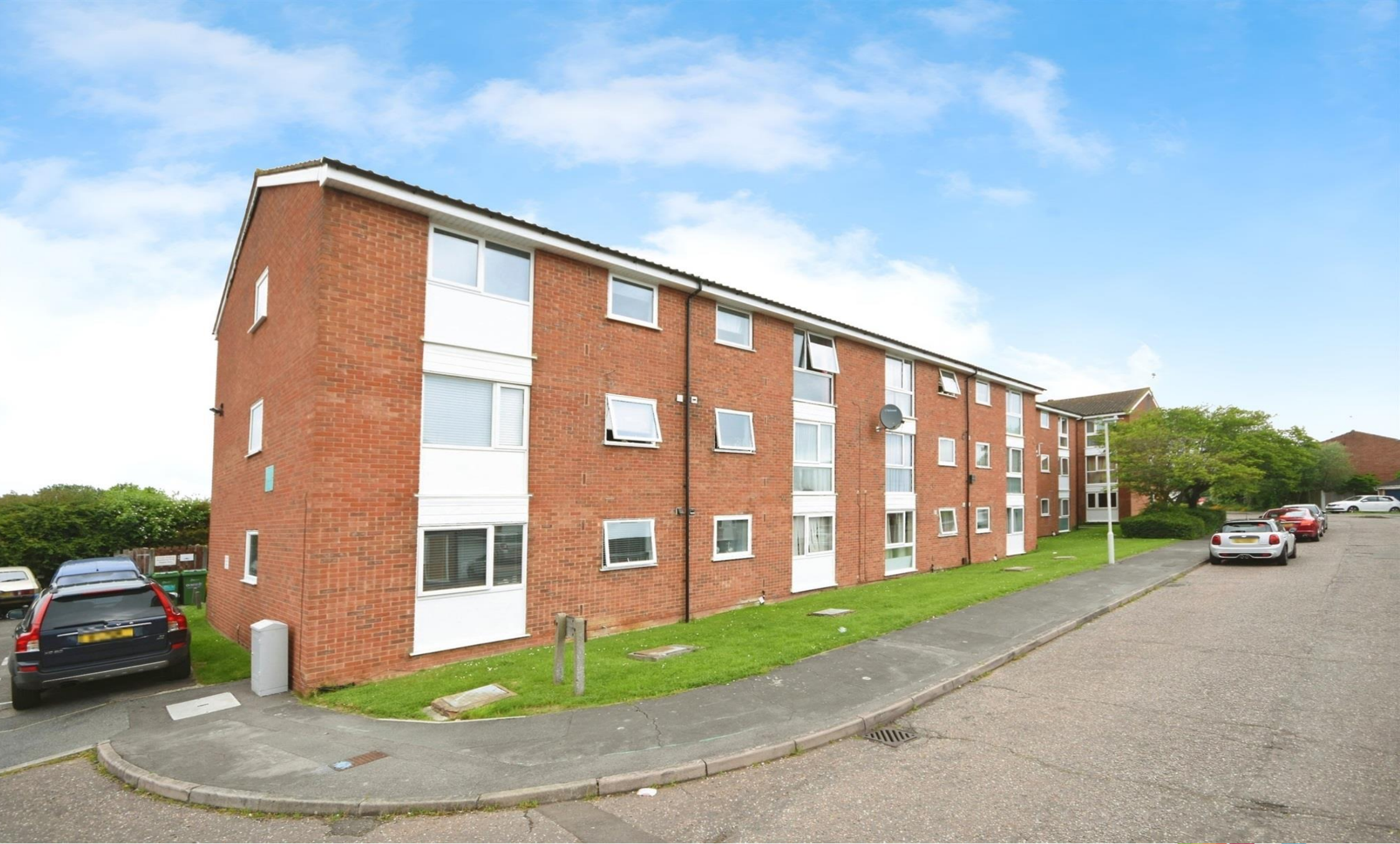
Hogarth Court, Rembrandt Grove, Chelmsford CM1 6GE