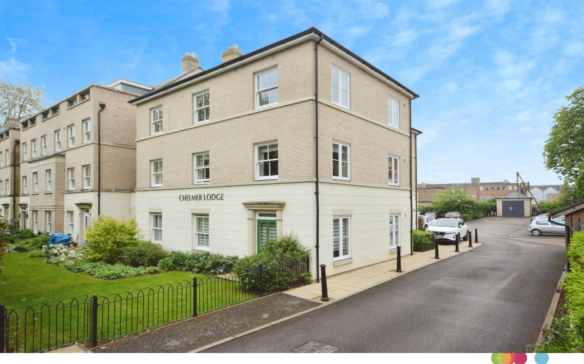
Chelmer Lodge New London Road, Chelmsford CM2 0FY