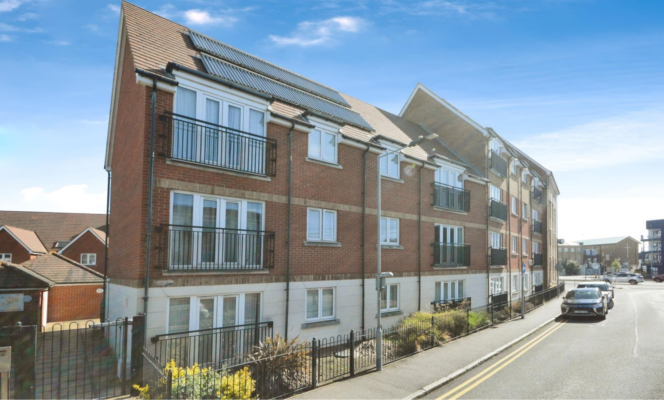
Primula Court Primrose Hill, CHELMSFORD CM1 2FZ