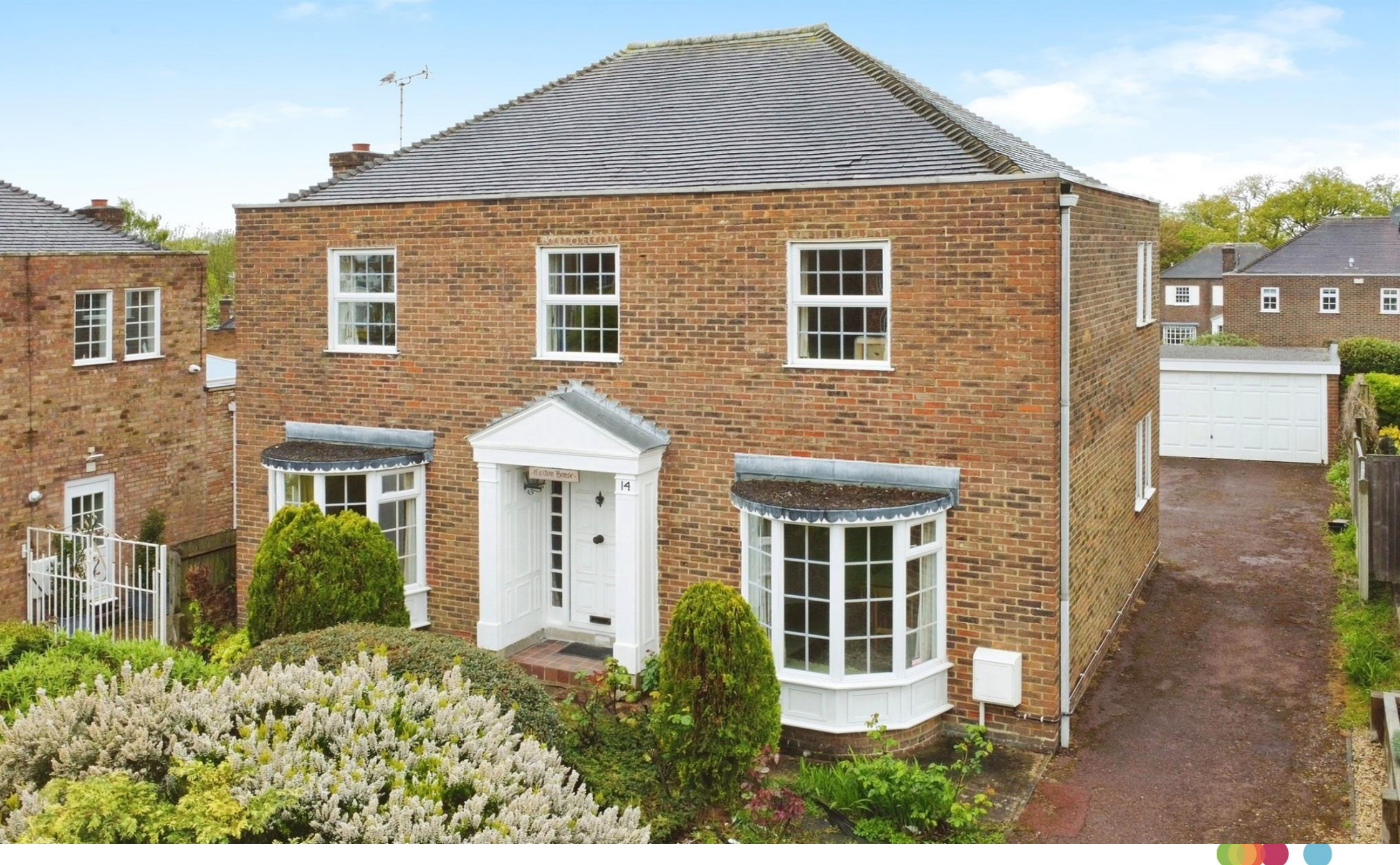
Beaumont Park, Danbury, Chelmsford CM3 4DE