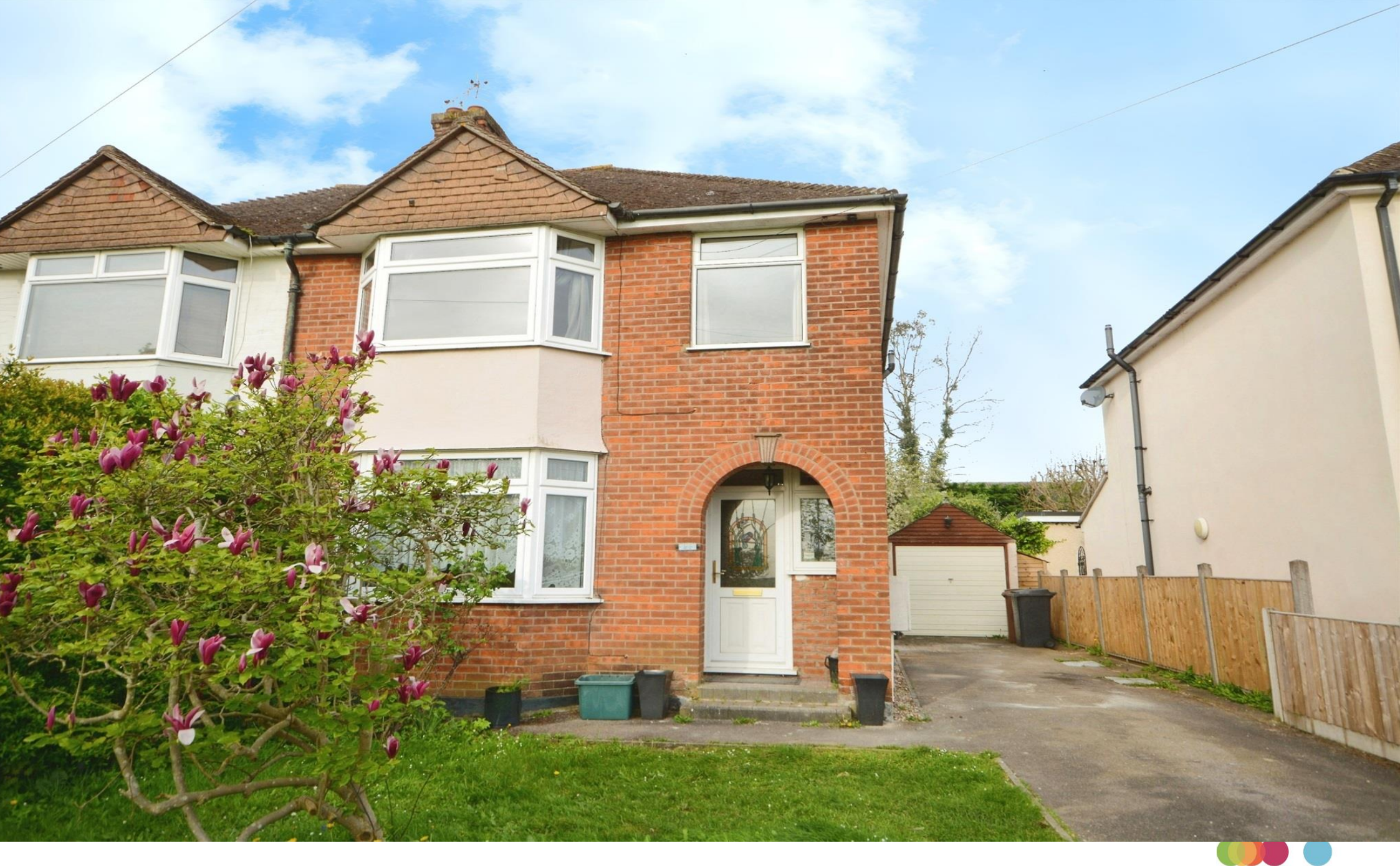
Main Road, Broomfield, CHELMSFORD CM1 7EJ