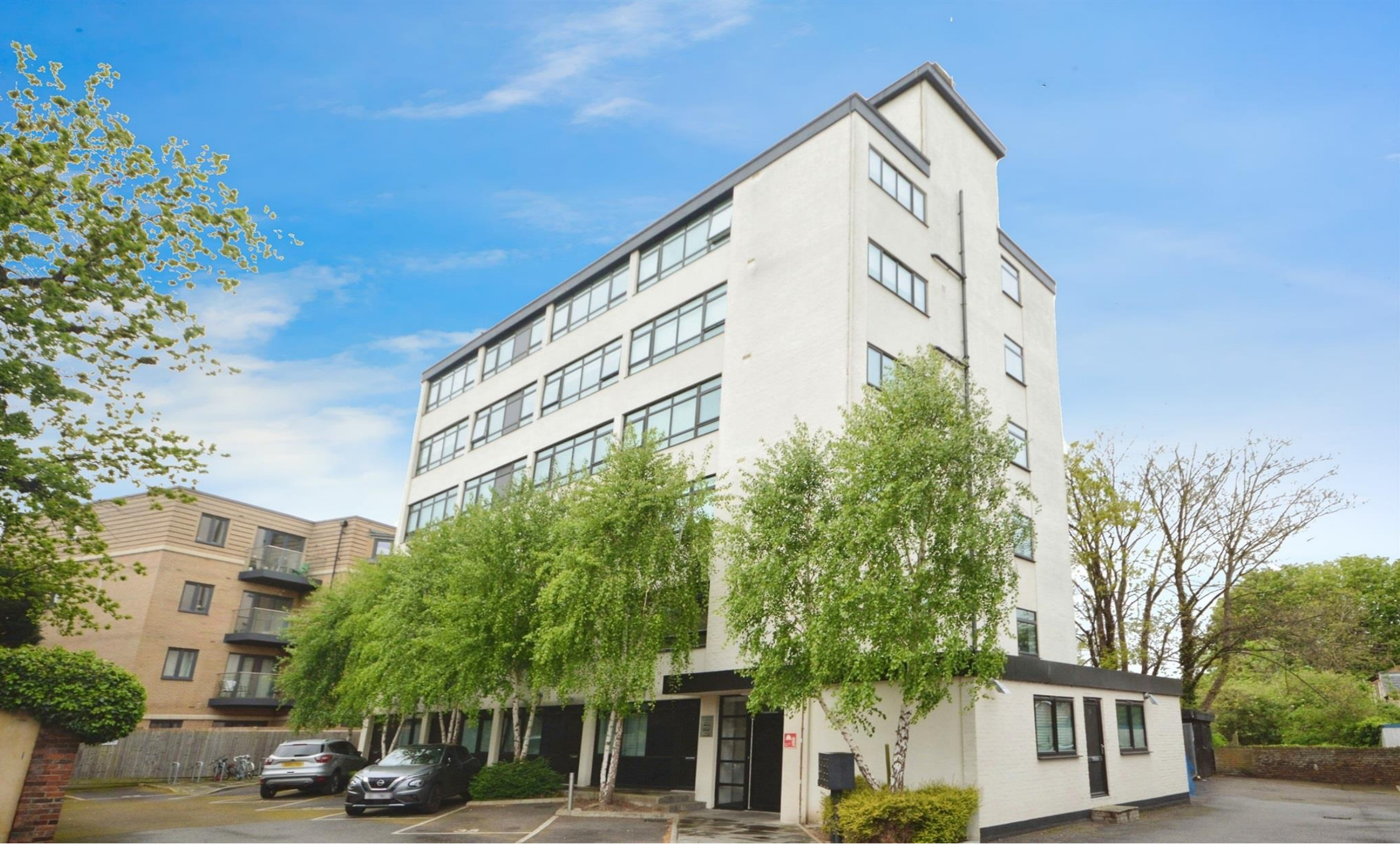
Celmeres Court, Springfield Road, Chelmsford CM2 6JG