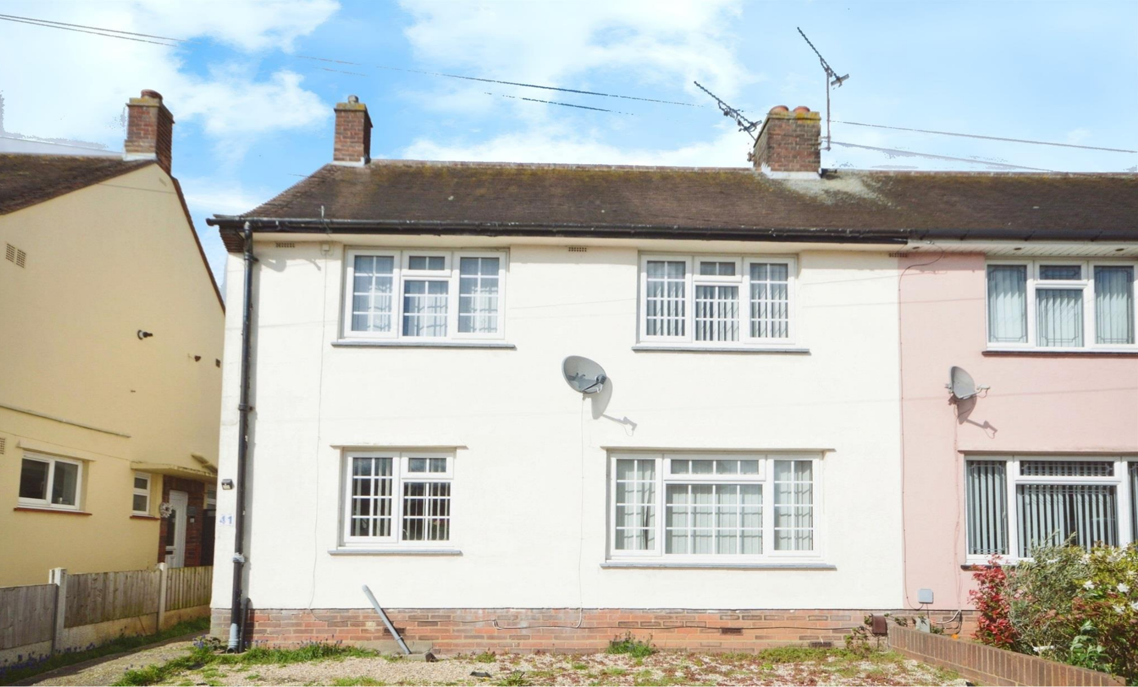
Shelley Road, CHELMSFORD CM2 6ER